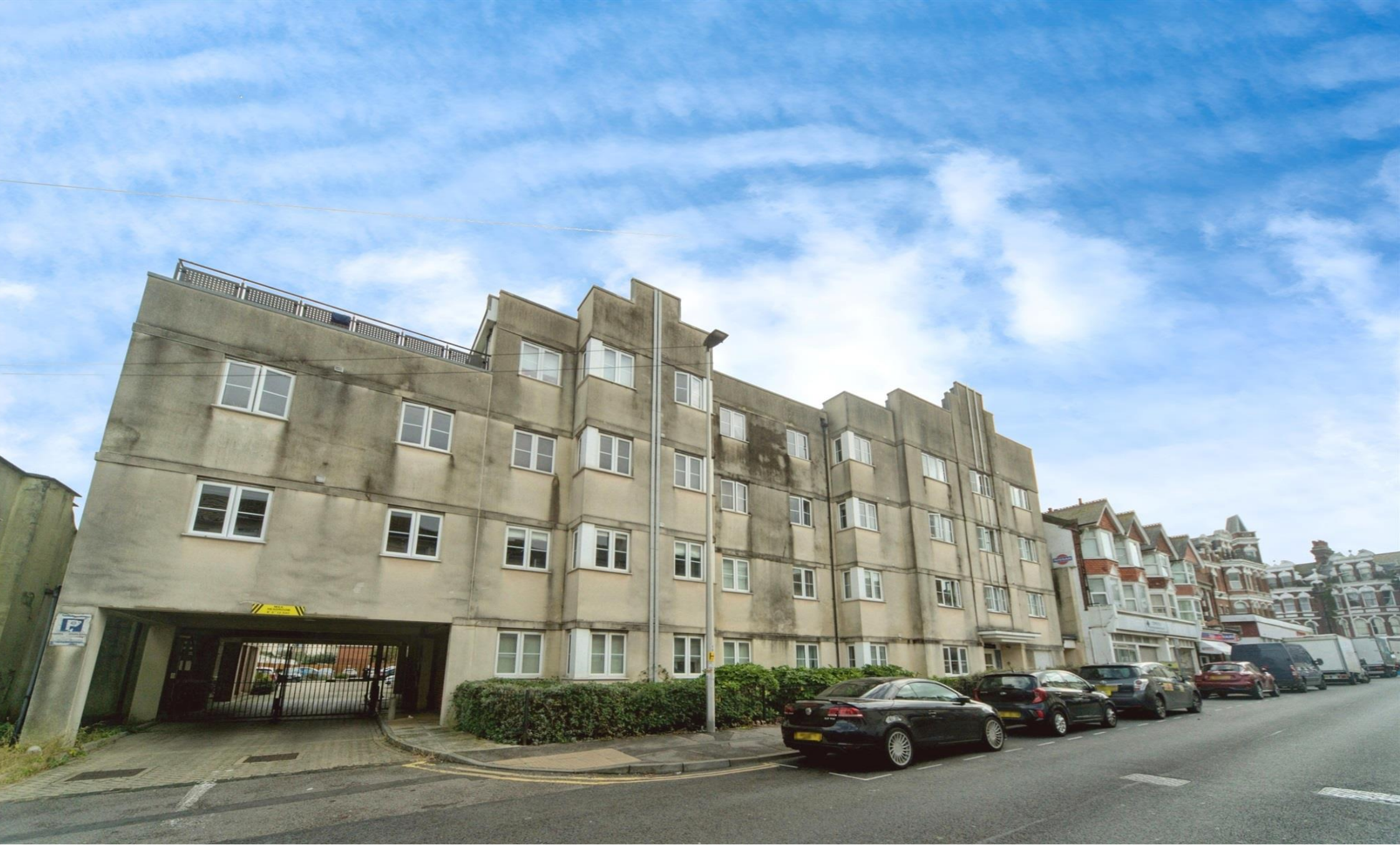
Discovery House Susans Road, Eastbourne BN21 3AG