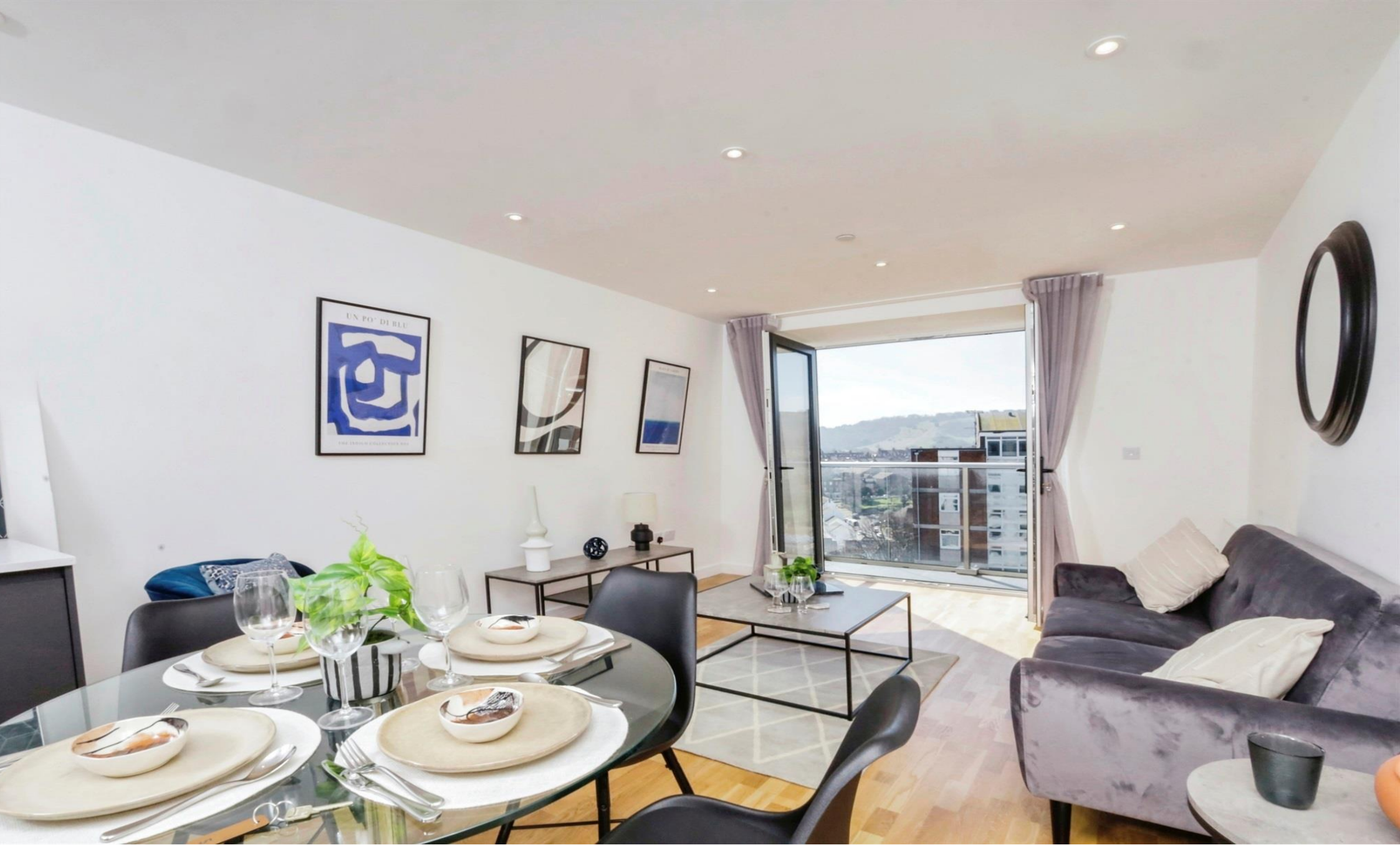
Solitaire House Upperton Road, Eastbourne BN21 1LP