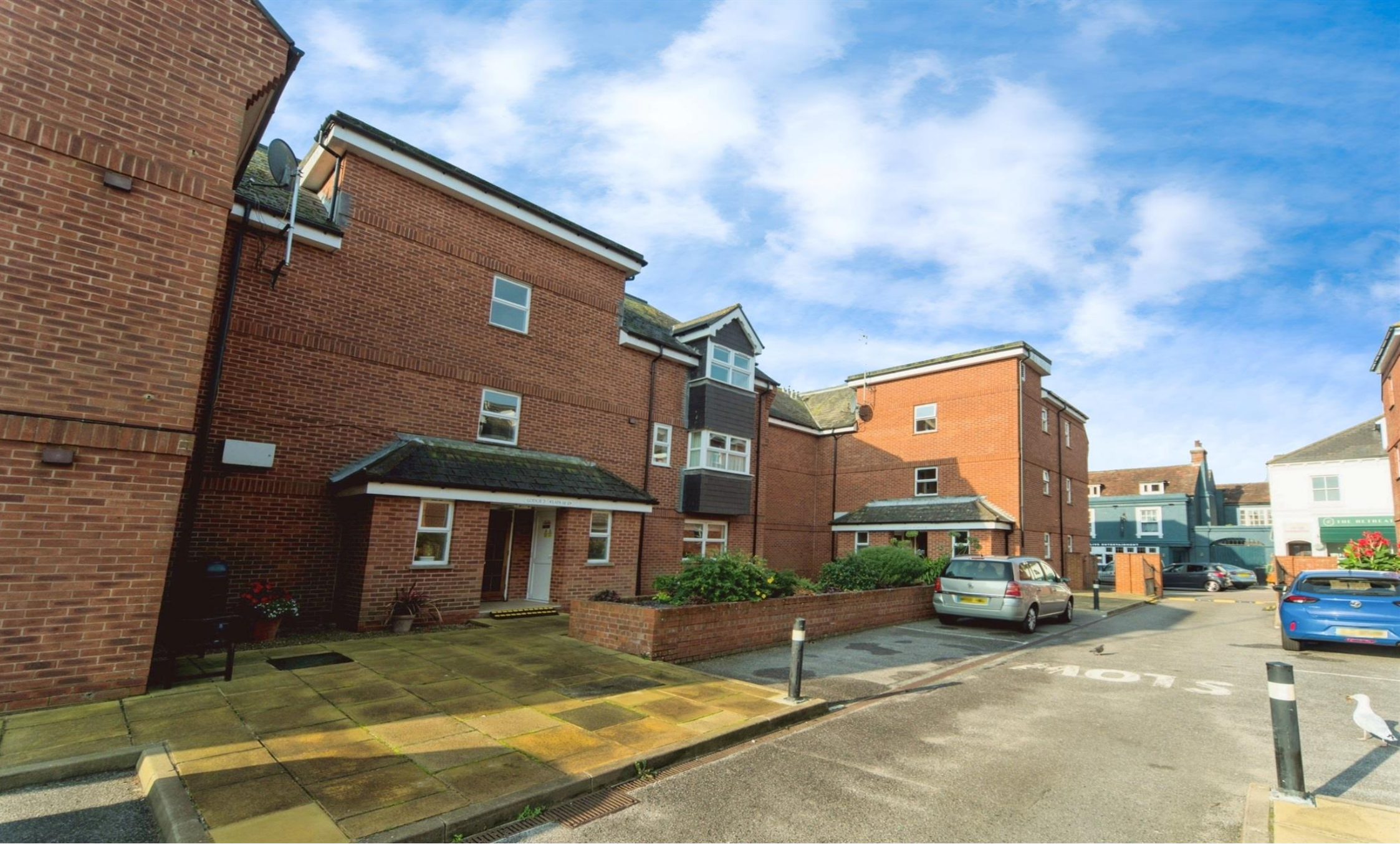
Crowne House Star Road, Eastbourne BN21 1NG