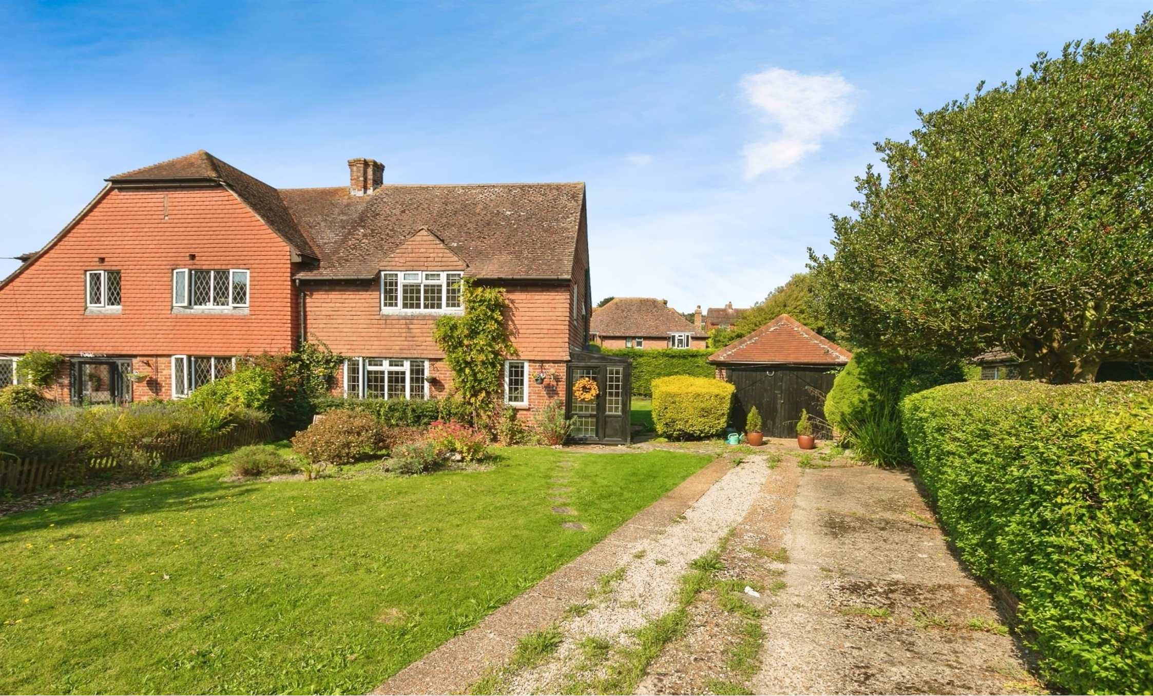
Downs View Close, East Dean Eastbourne BN20 0DT