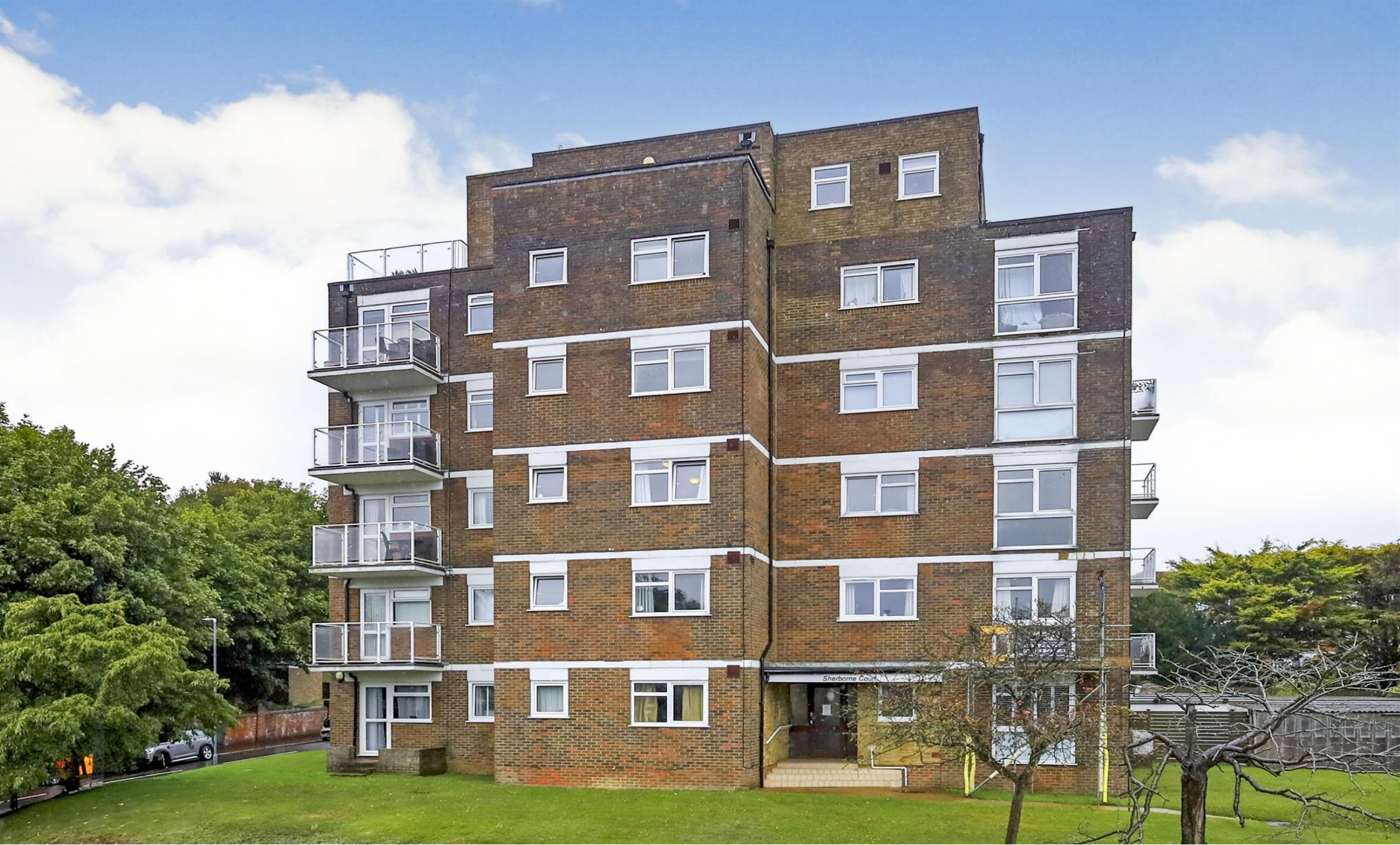
Sherborne Court Upperton Road, Eastbourne BN21 1LU