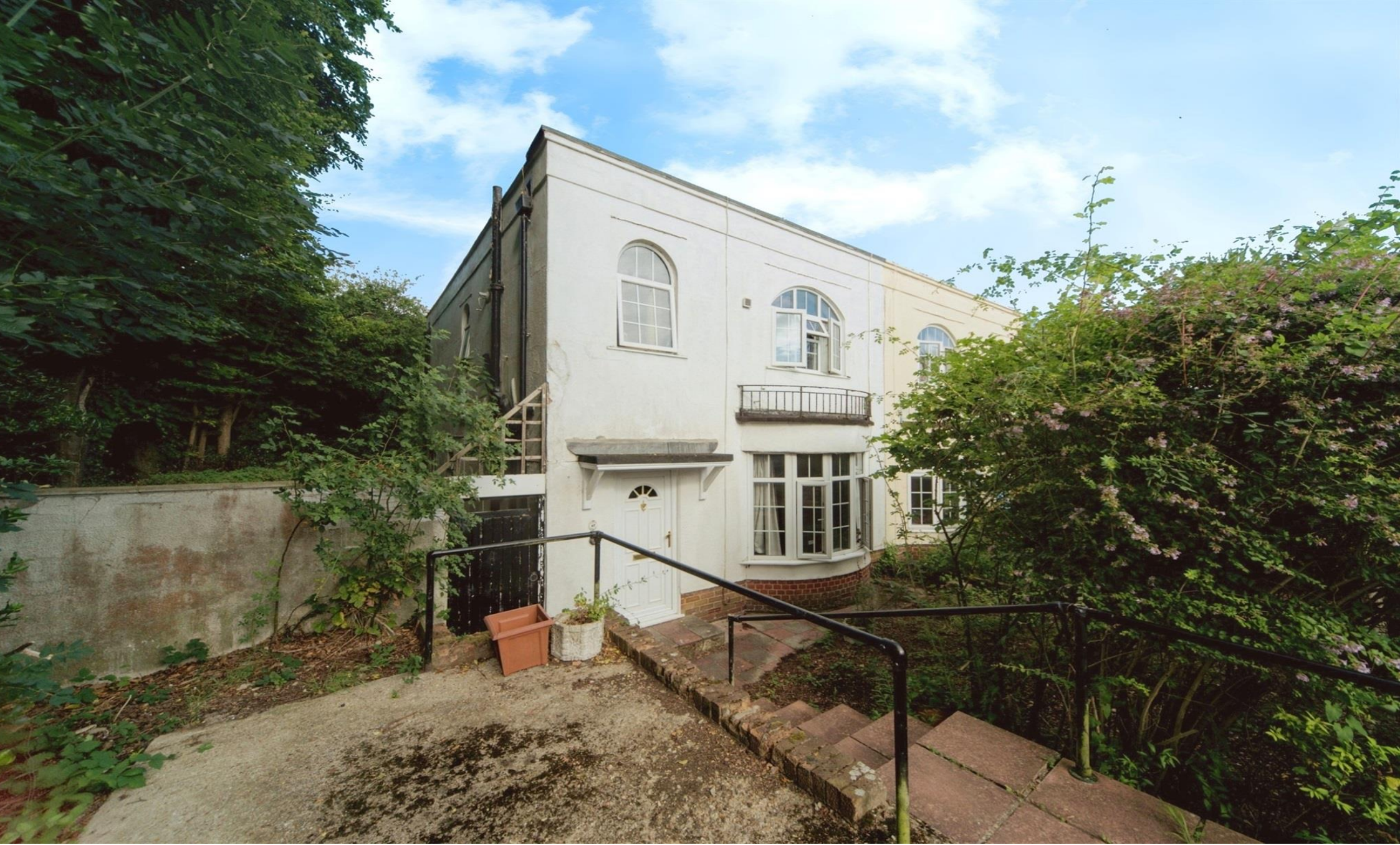
Falmer Close, EASTBOURNE BN20 9AB

Not for marketing purposes. INTERNAL USE ONLY