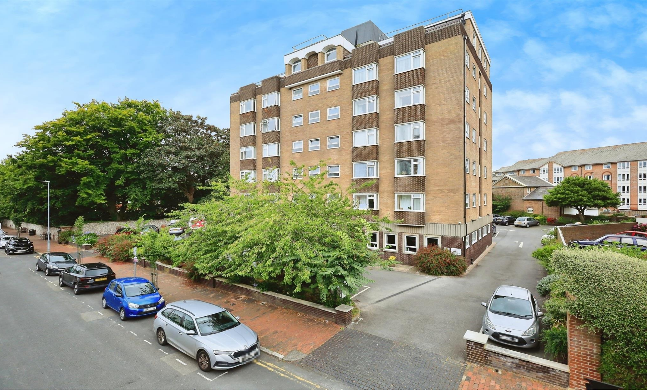
Westdown House Hartington Place, Eastbourne BN21 3BW