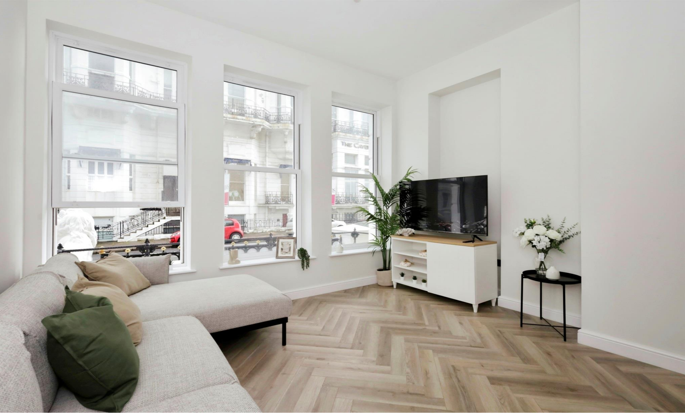
Grande View, Eastbourne BN21 4AR