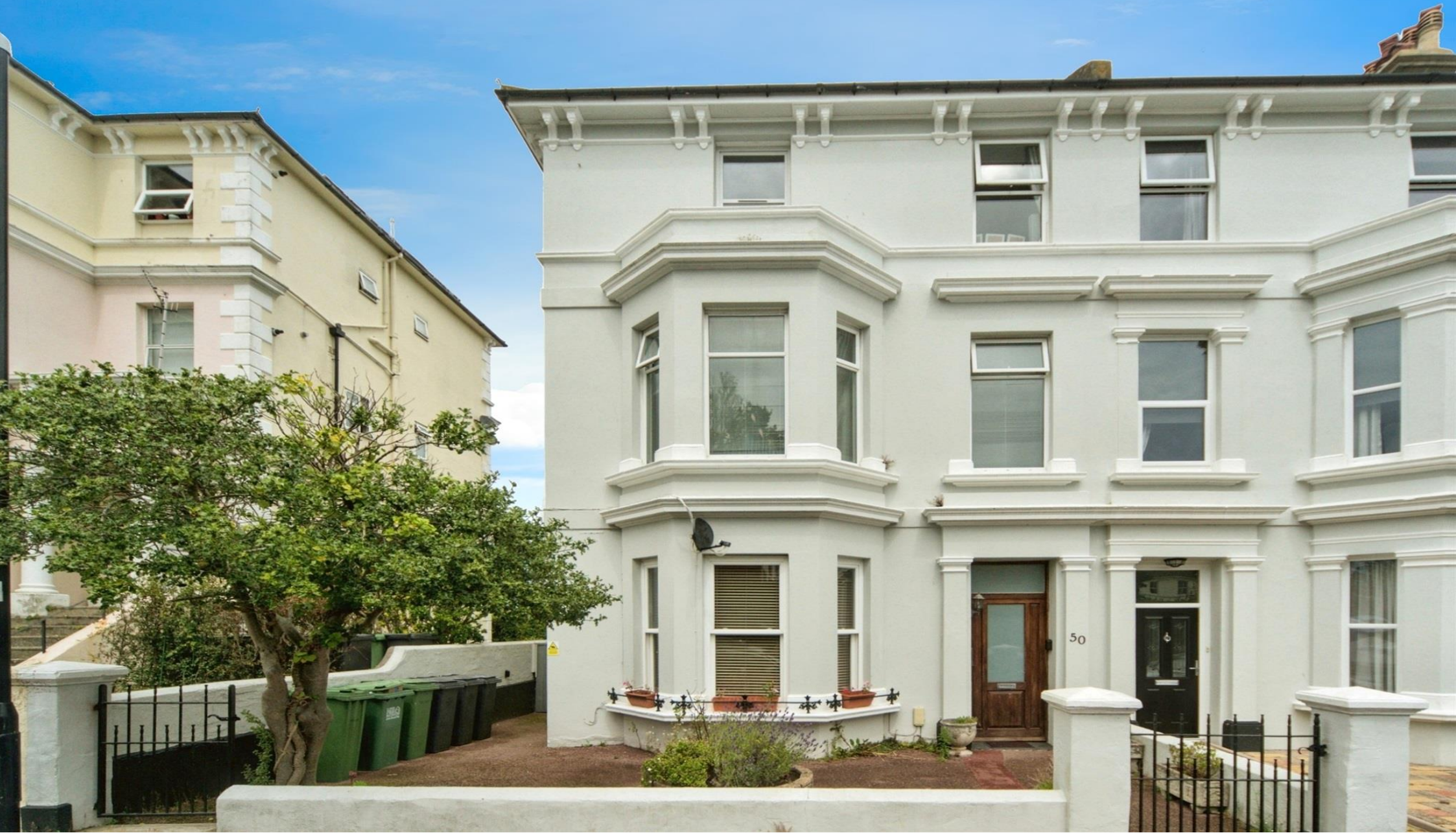
Upperton Gardens, Eastbourne BN21 2AQ