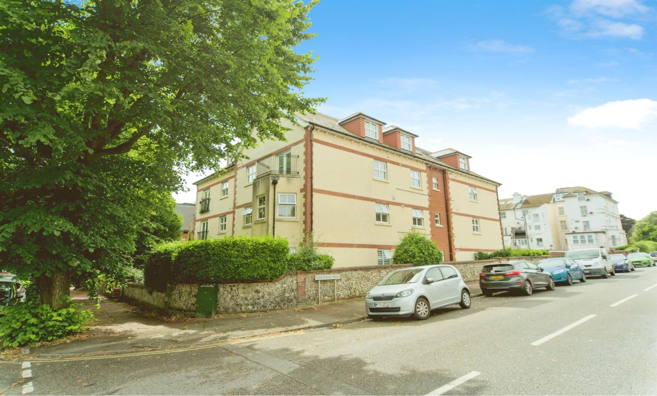
The Yews, St. Leonards Road, Eastbourne, BN21 3AQ