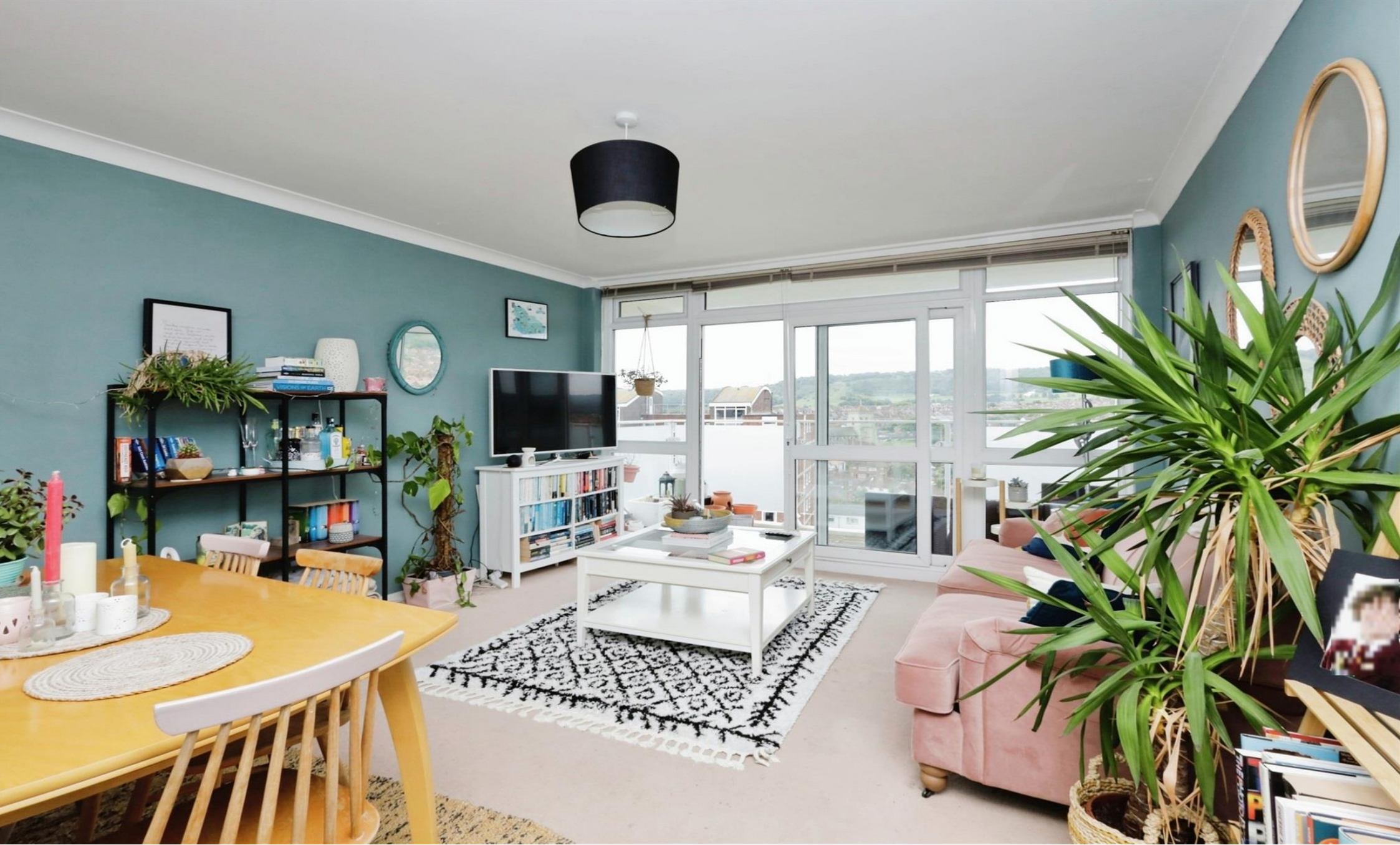
Arlington House Upperton Road, Eastbourne BN21 1LR