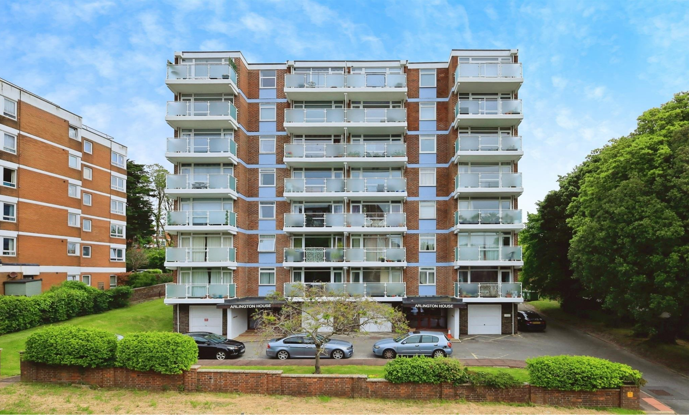
Arlington House Upperton Road, Eastbourne BN21 1LR