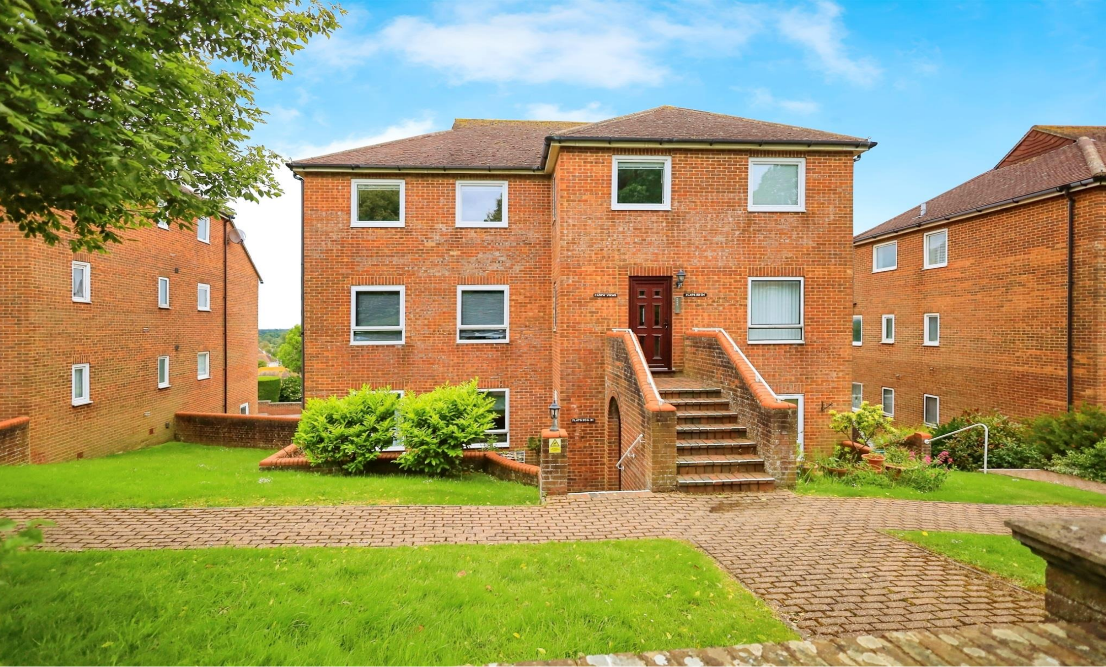
Carew Views Carew Road, Eastbourne BN21 2JL