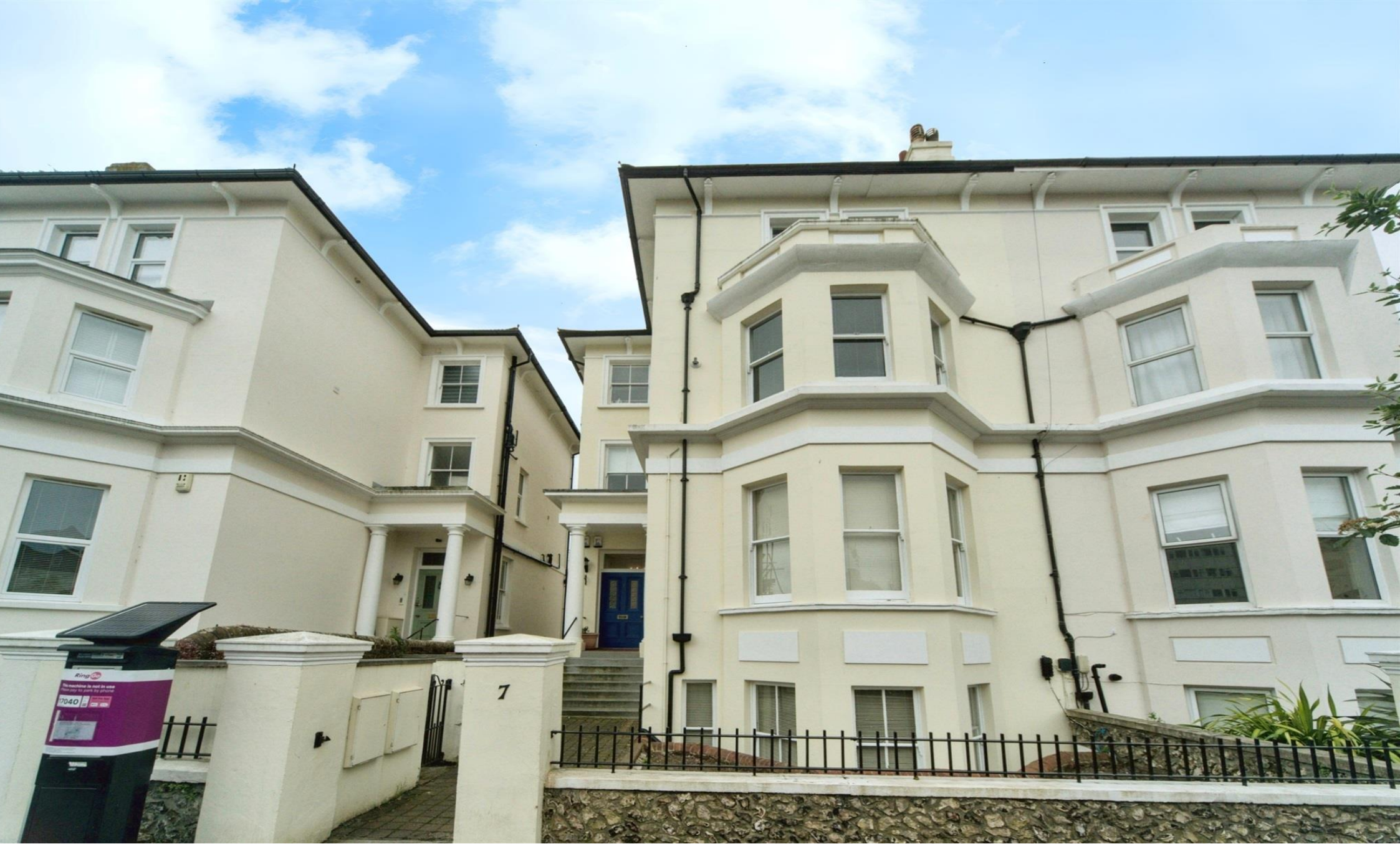
Chiswick Place, Eastbourne BN21 4NH