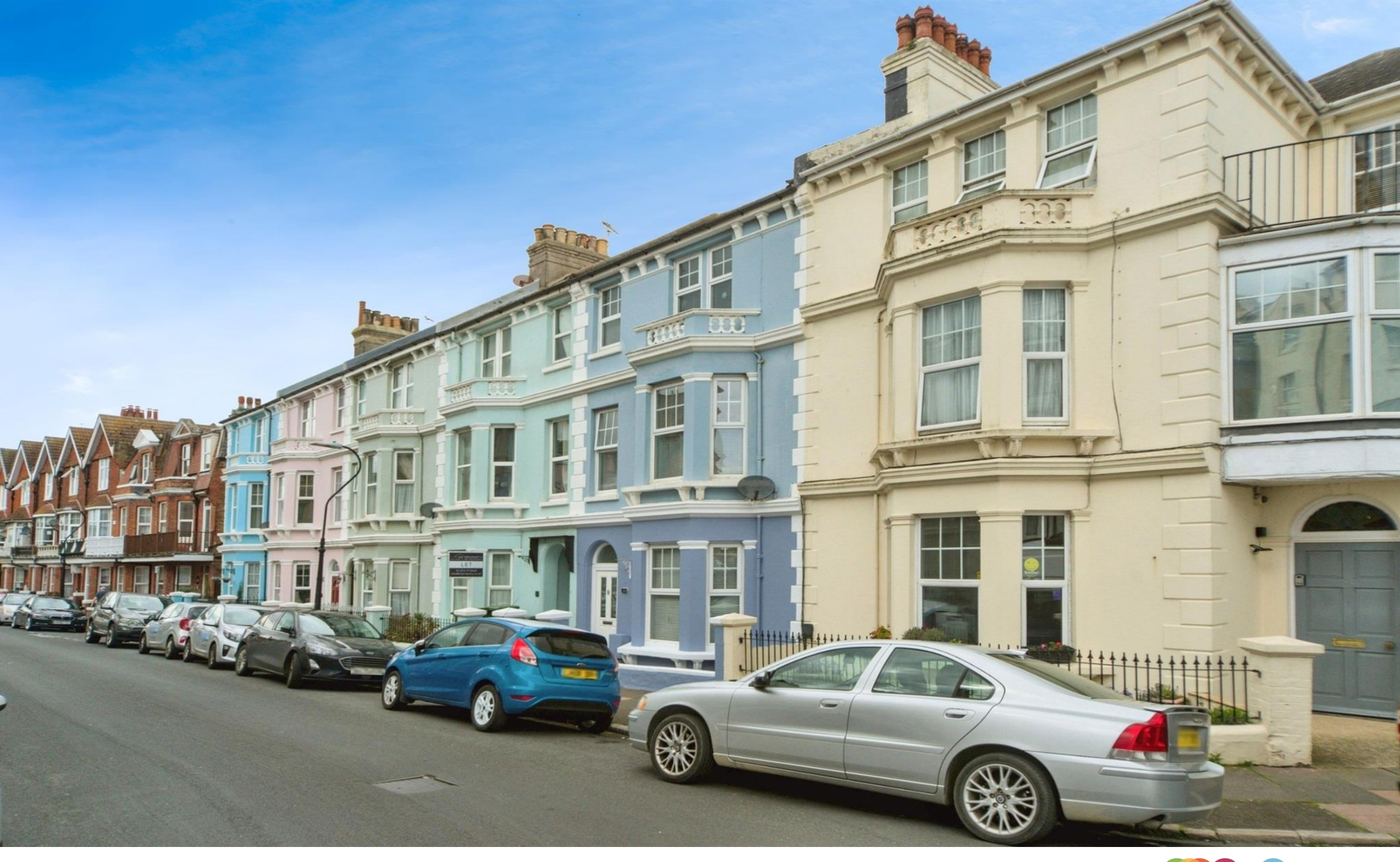
St. Aubyns Road, Eastbourne BN22 7AS