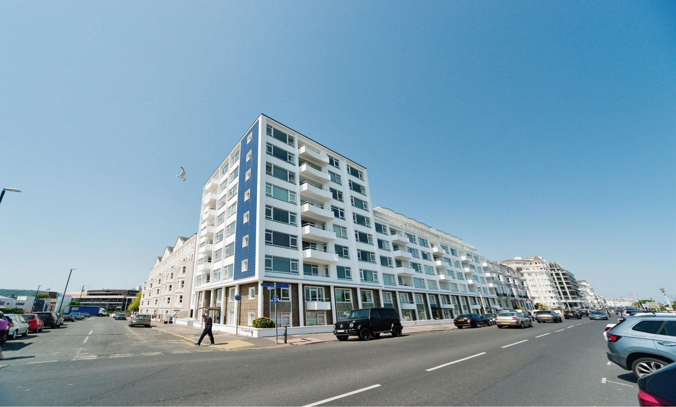
Grand Court King Edwards Parade, Eastbourne BN21 4BX