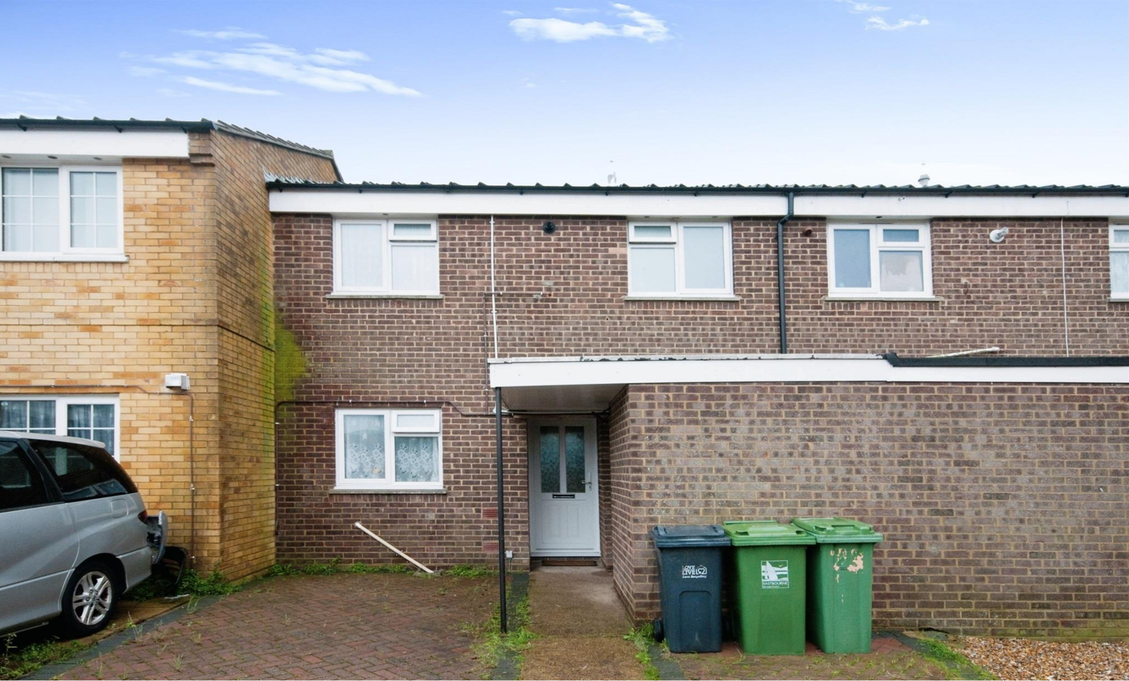
Mulberry Close, Eastbourne, BN22 0TU