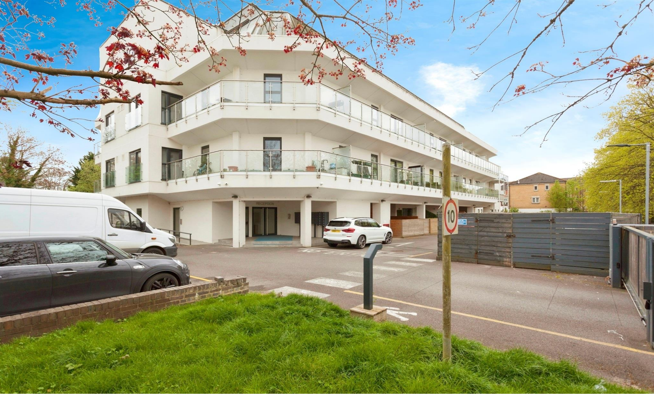
Octagon House Russell Way, Crawley RH10 1GW