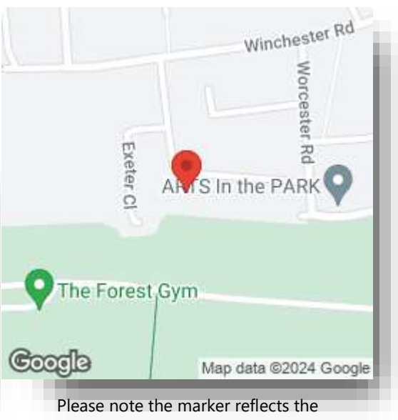
postcode not the actual property

view this property online fox-and-sons.co.uk/Property/CRA109934