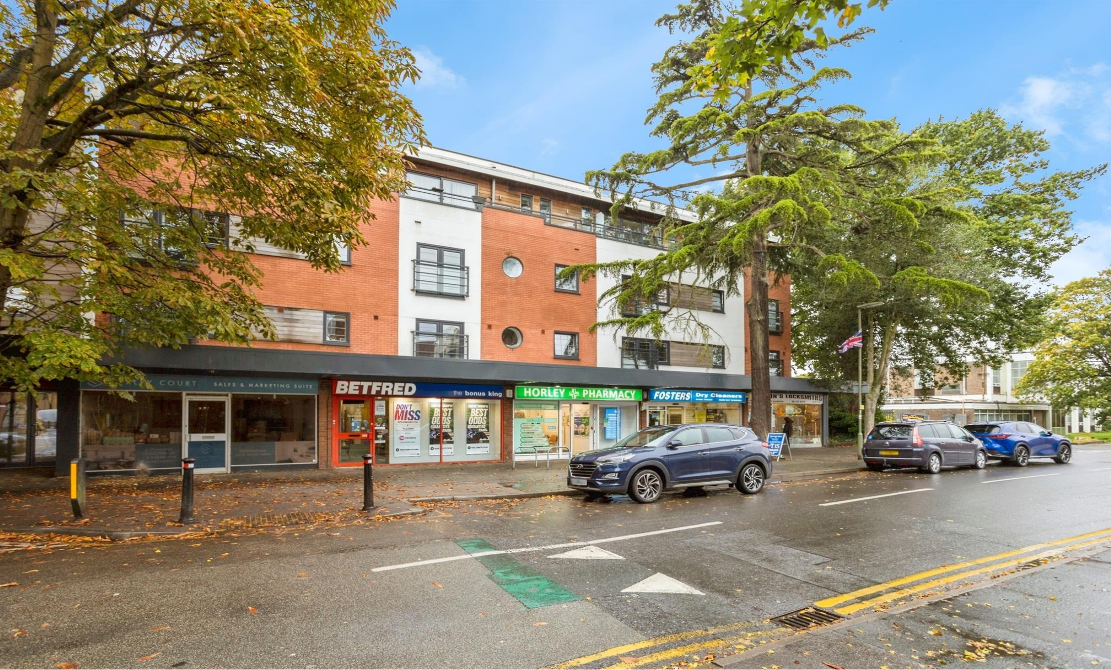
Saxley Court, Victoria Road, Horley, RH6 7LT