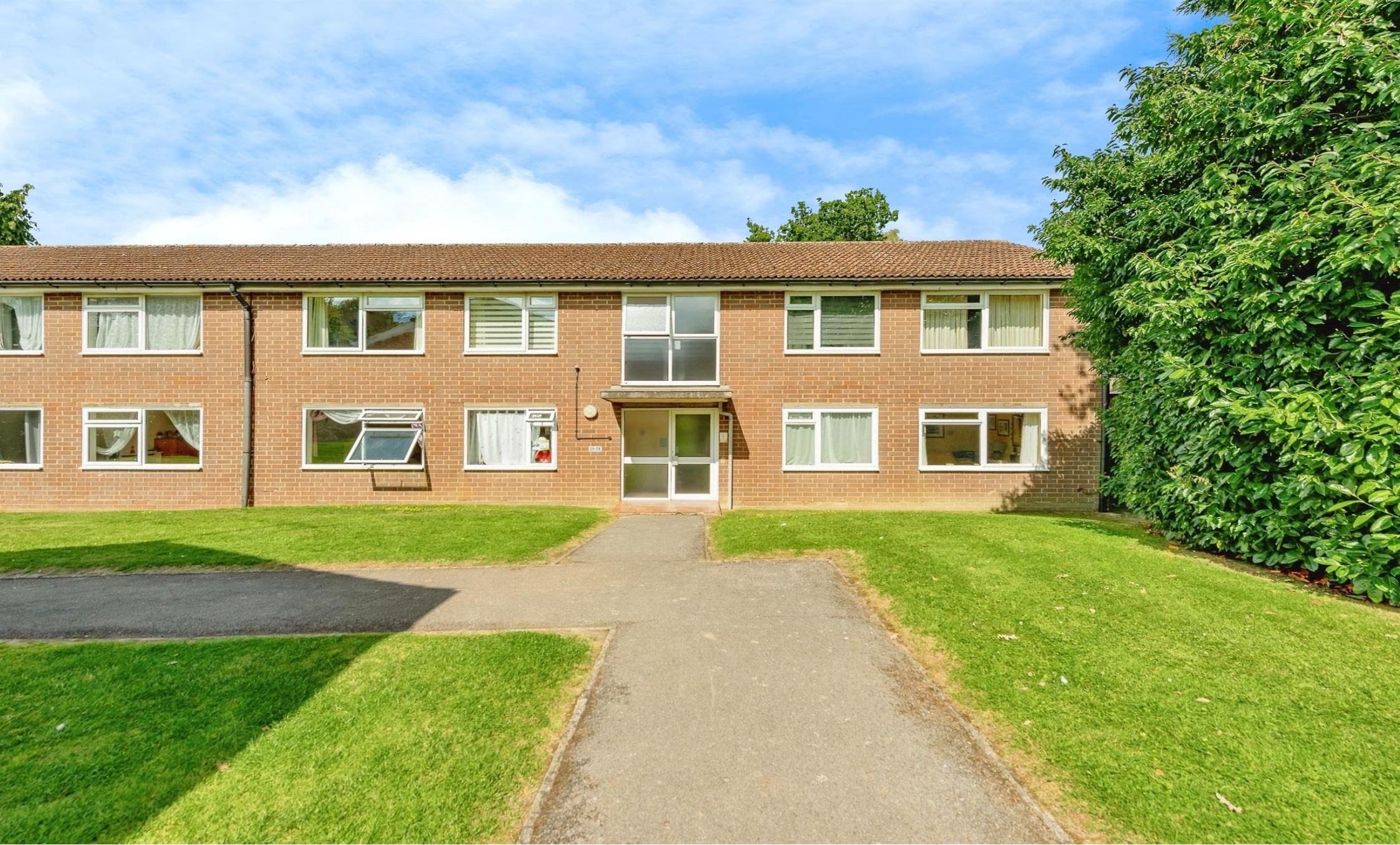
St Georges Court, London Road, East Grinstead RH19 1QP