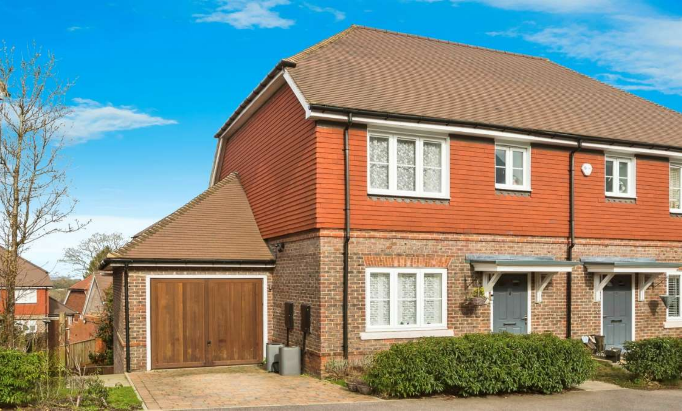
Clockfield, Turners Hill CRAWLEY RH10 4AR