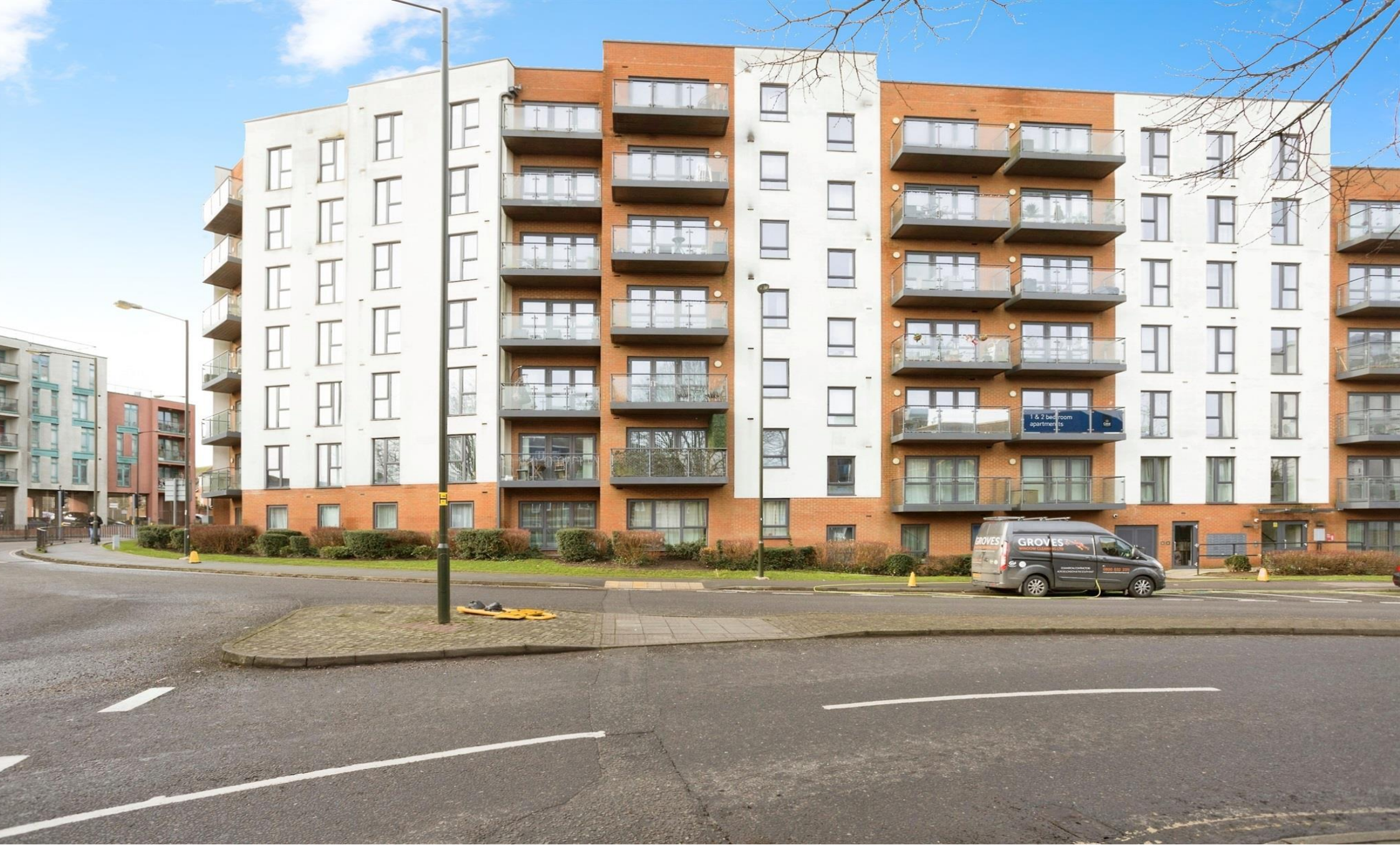
Apex Apartments West Green Drive, Crawley RH11 7QN