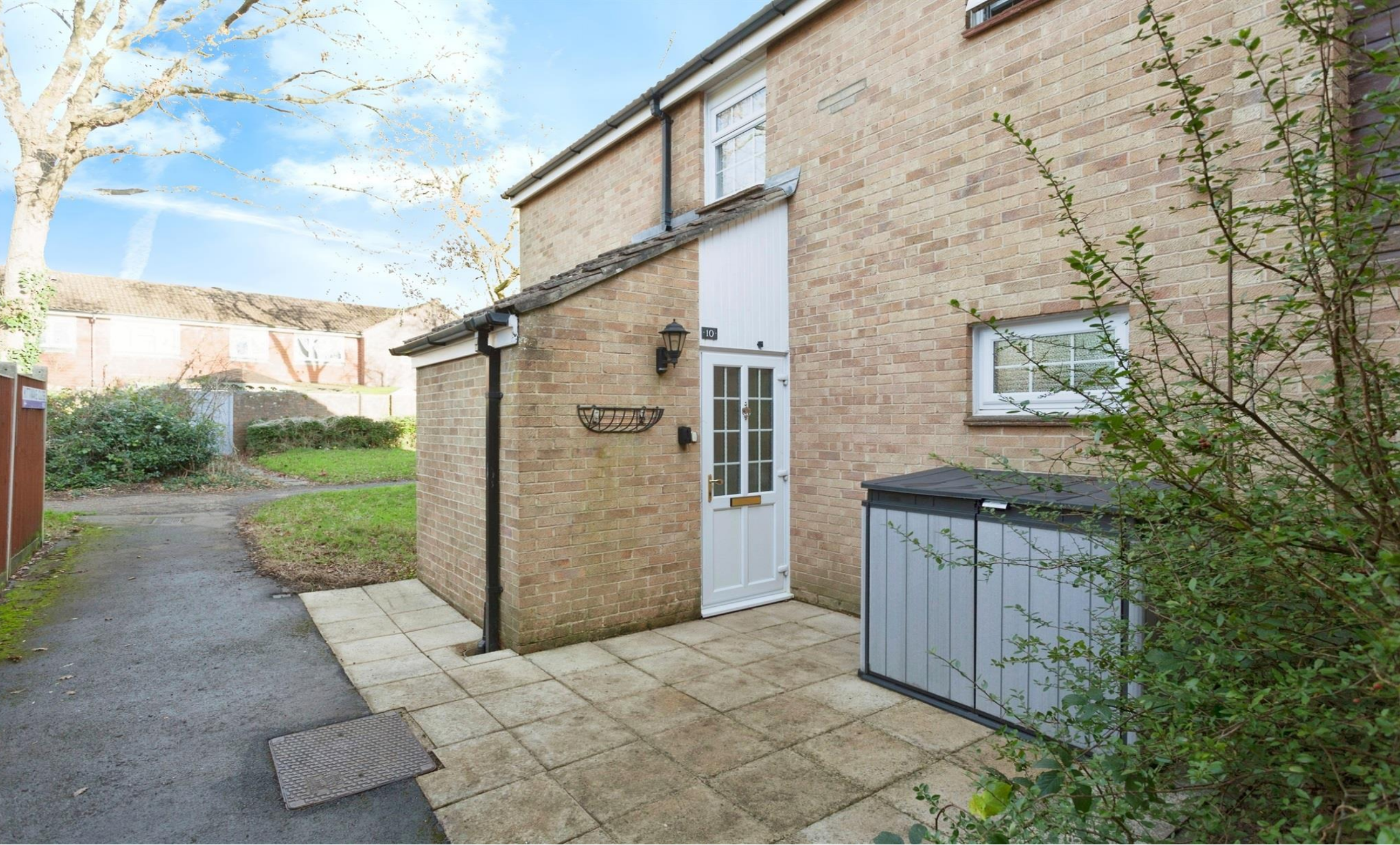
Kittiwake Close, Ifield Crawley RH11 0SD