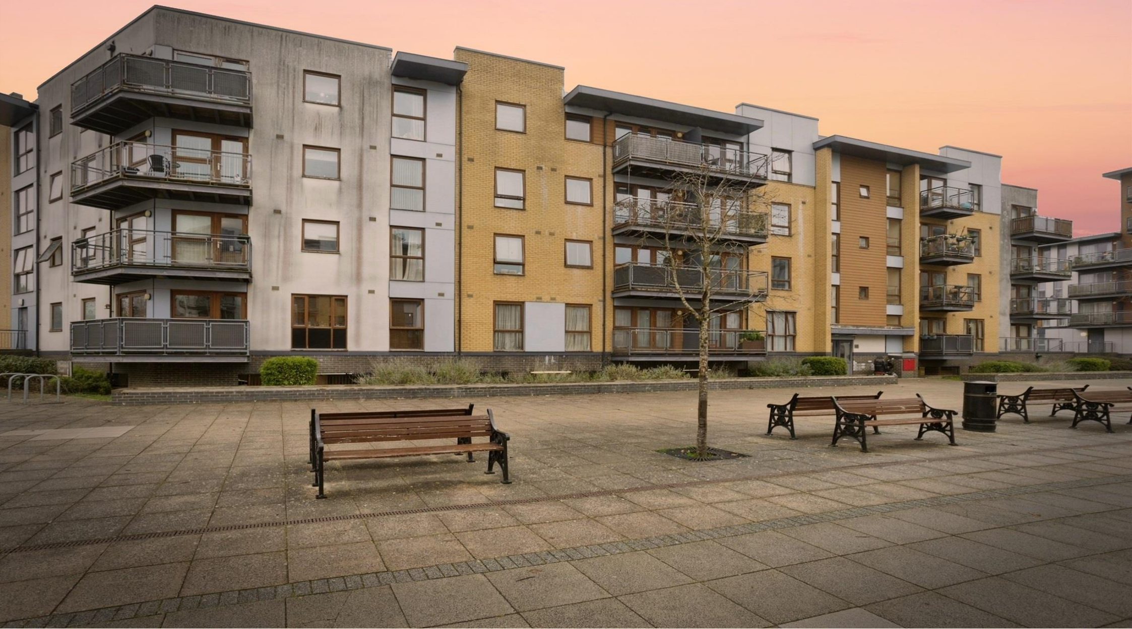
Howlands Court Commonwealth Drive, Crawley RH10 1AW