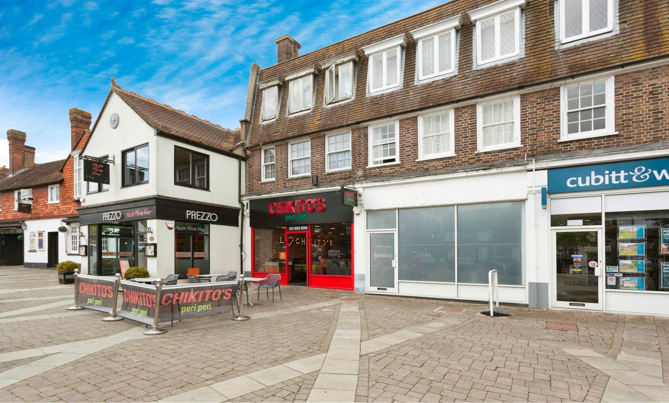
Grand Parade, Crawley RH10 1BU