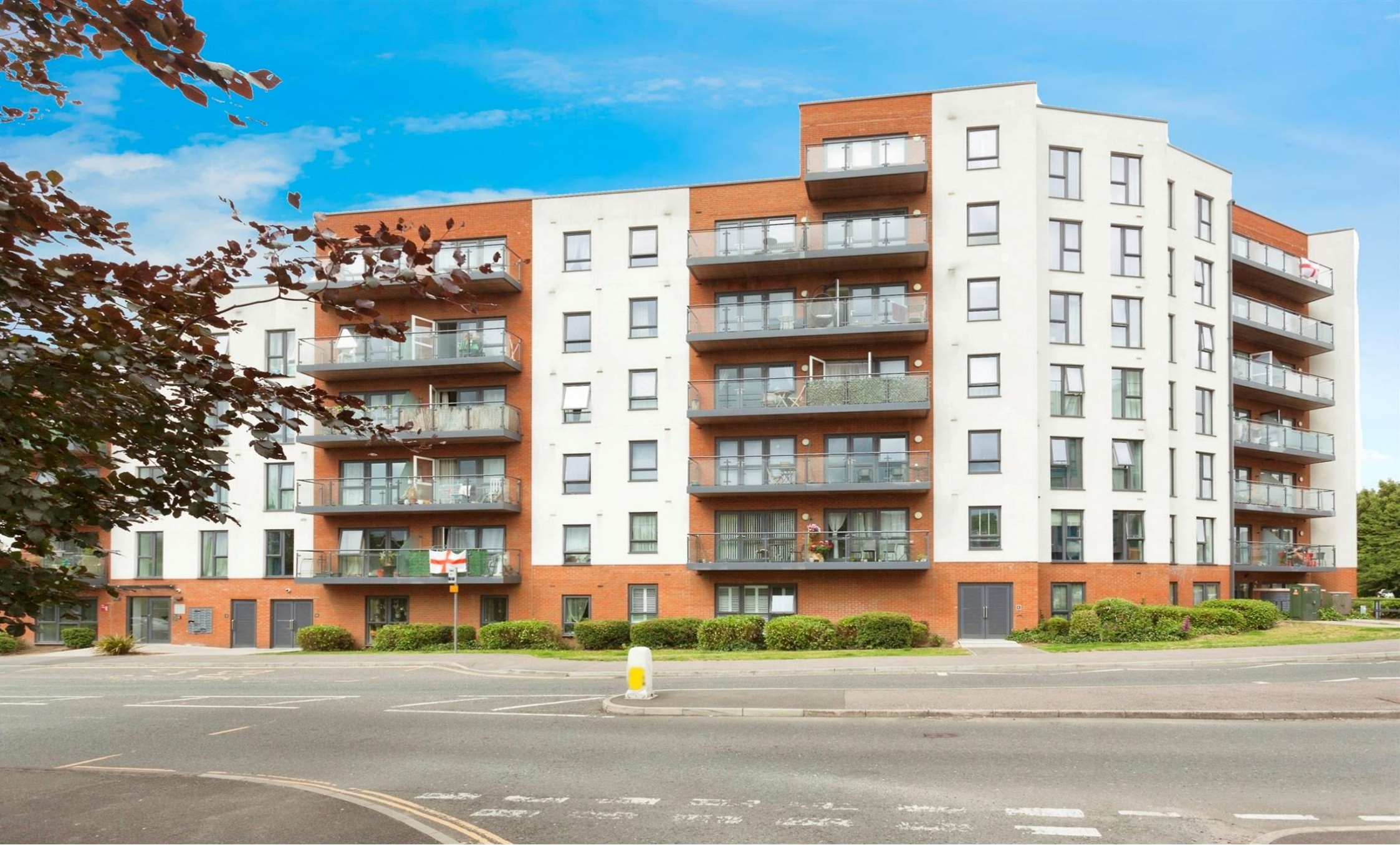
Apex Apartments Ifield Road, Crawley RH11 7PD