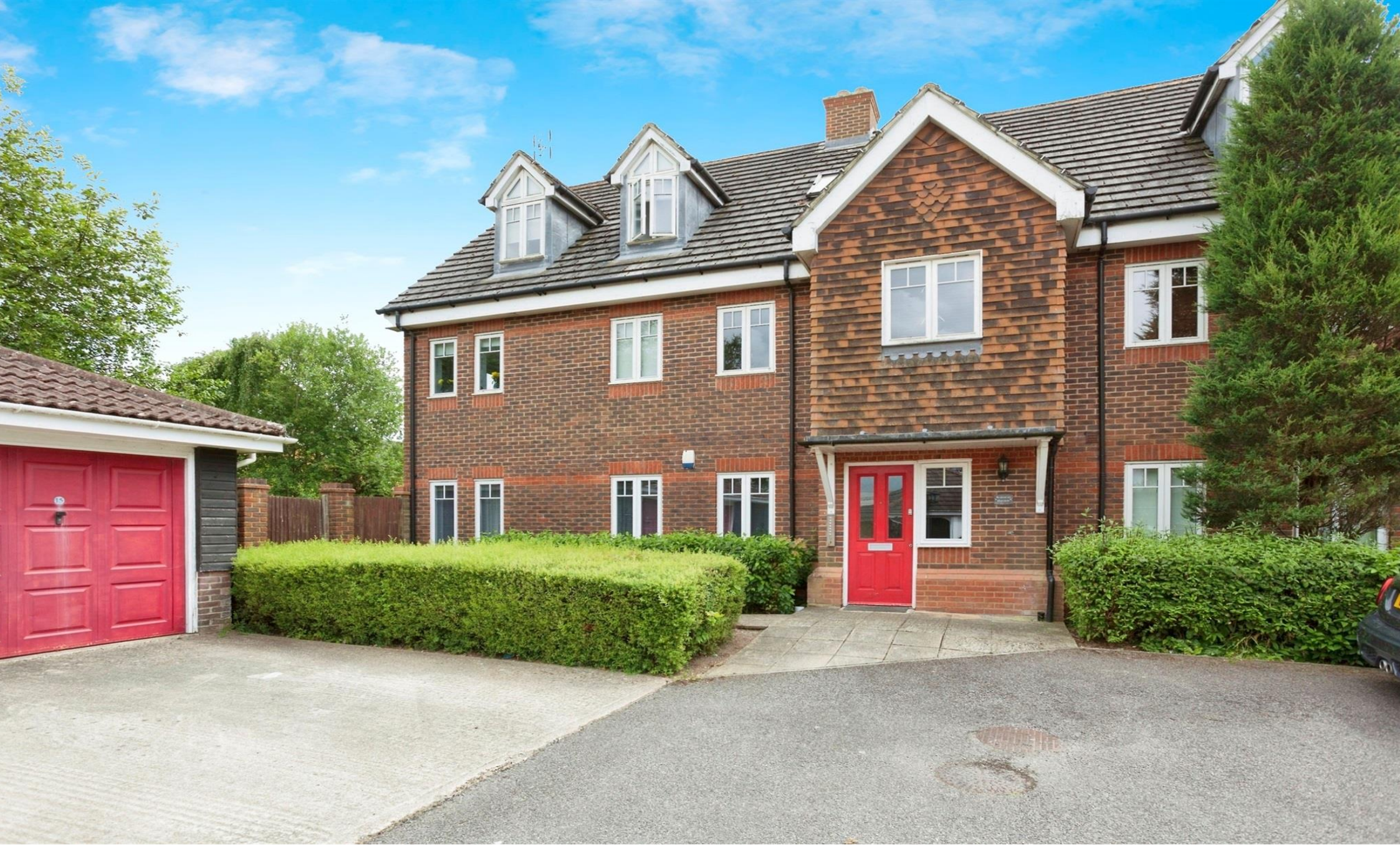
Rosemead Gardens, Crawley RH10 6TY