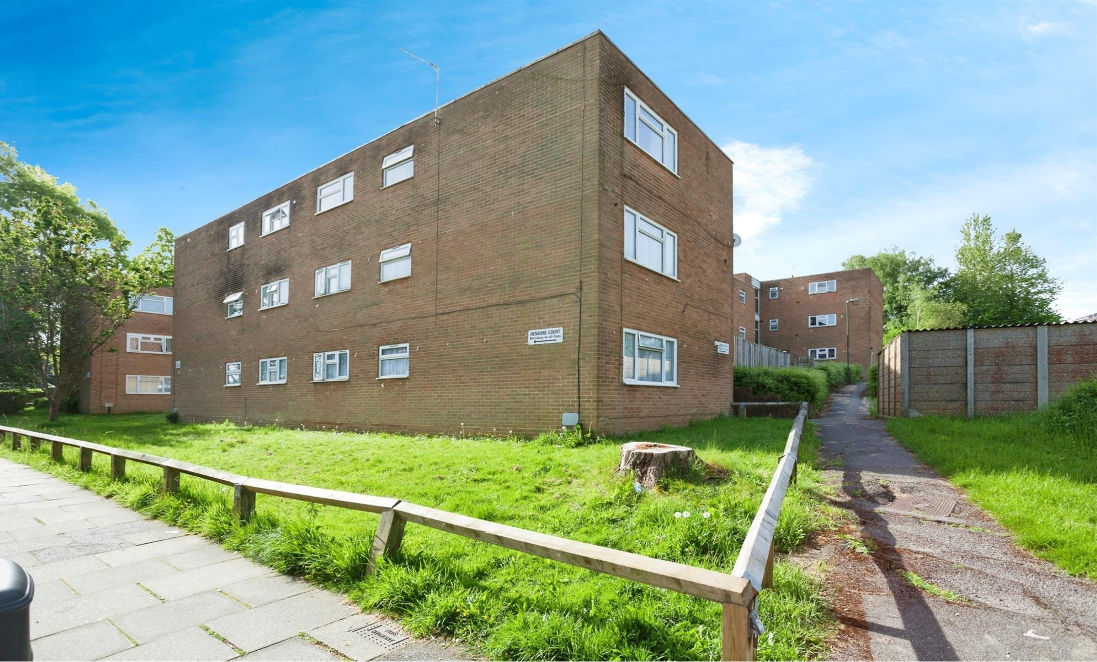
Henbane Court Trefoil Crescent, Crawley RH11 9EX