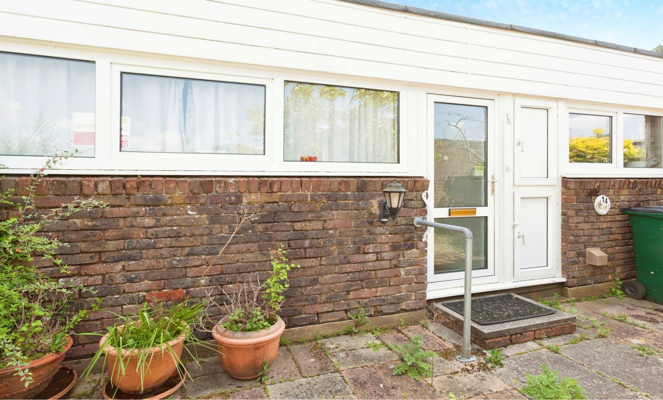
Highdown Court Forestfield, Crawley RH10 6PR