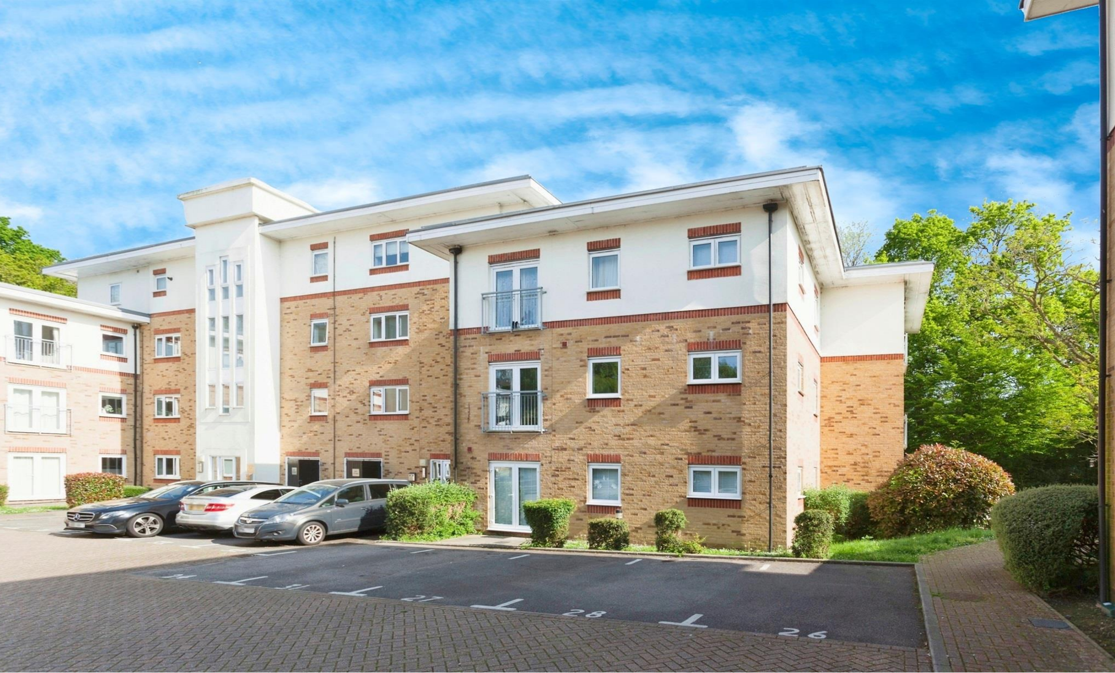
Copeland House Rathlin Road, Crawley RH11 9GA