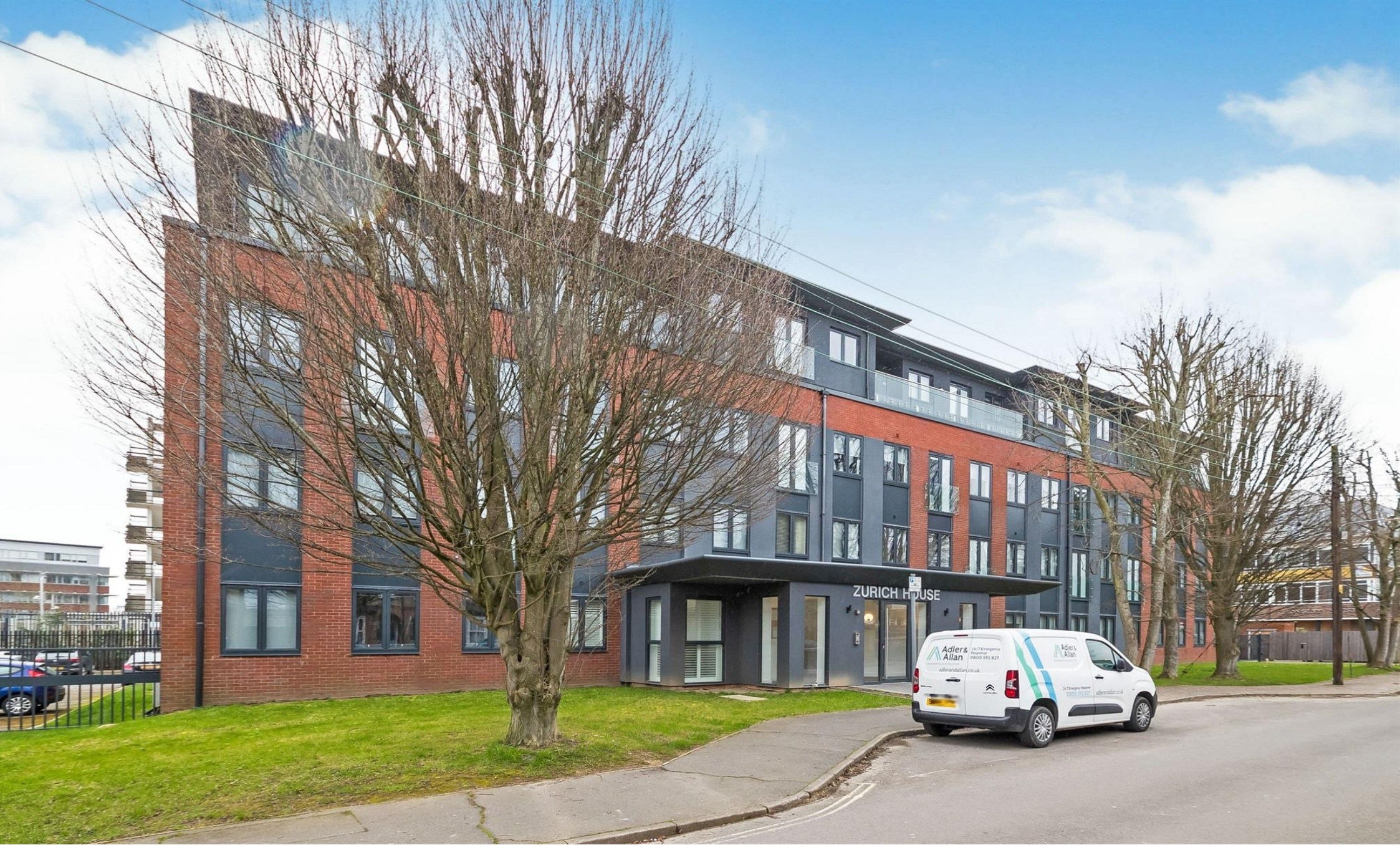
Zurich House East Park, Crawley RH10 6GT