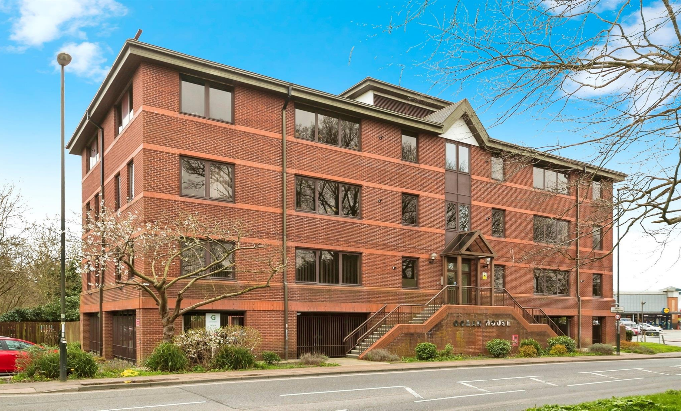
Ocean House Hazelwick Avenue, Crawley RH10 1NP