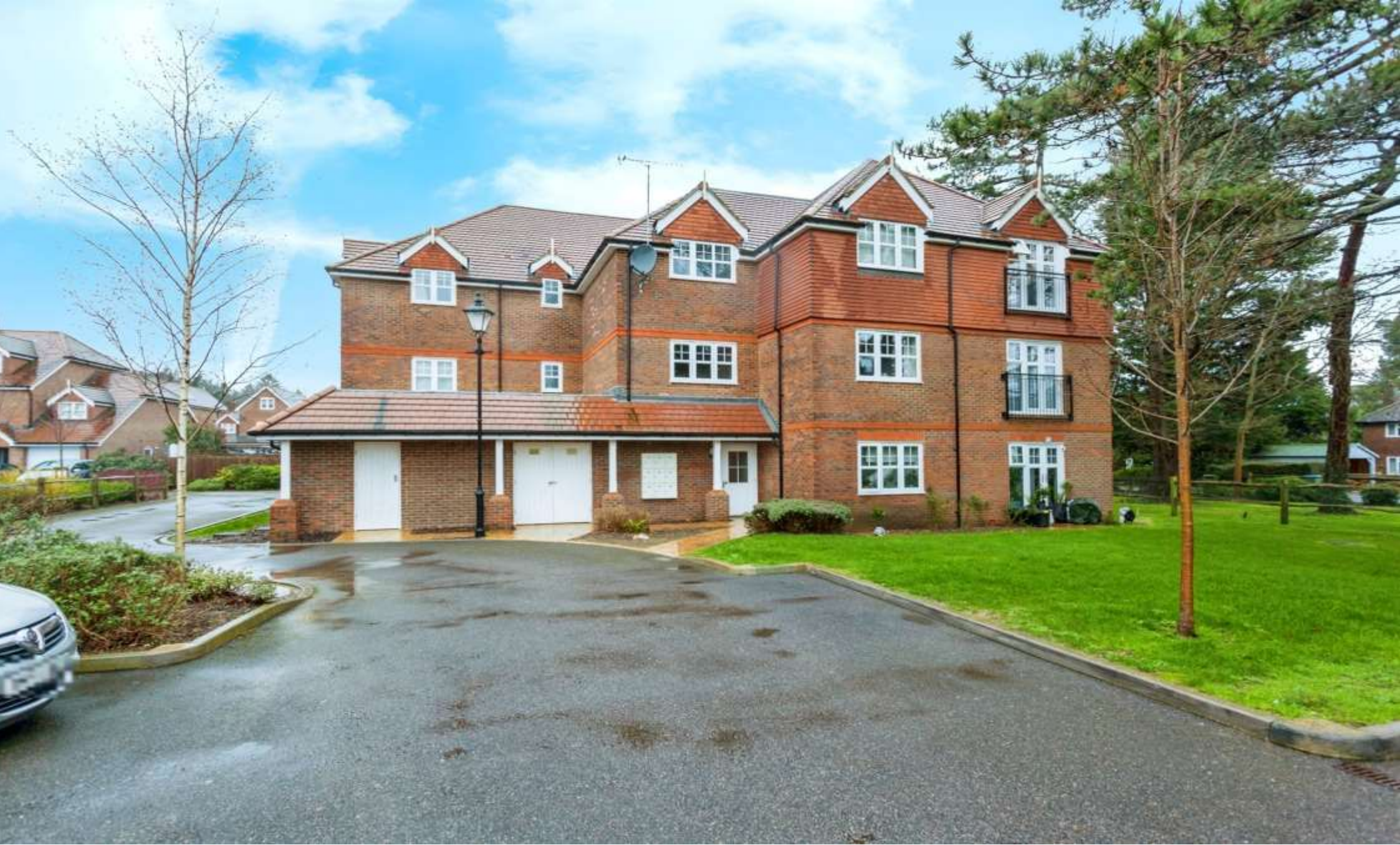
Summerwood, Ifield, Crawley RH11 0DZ