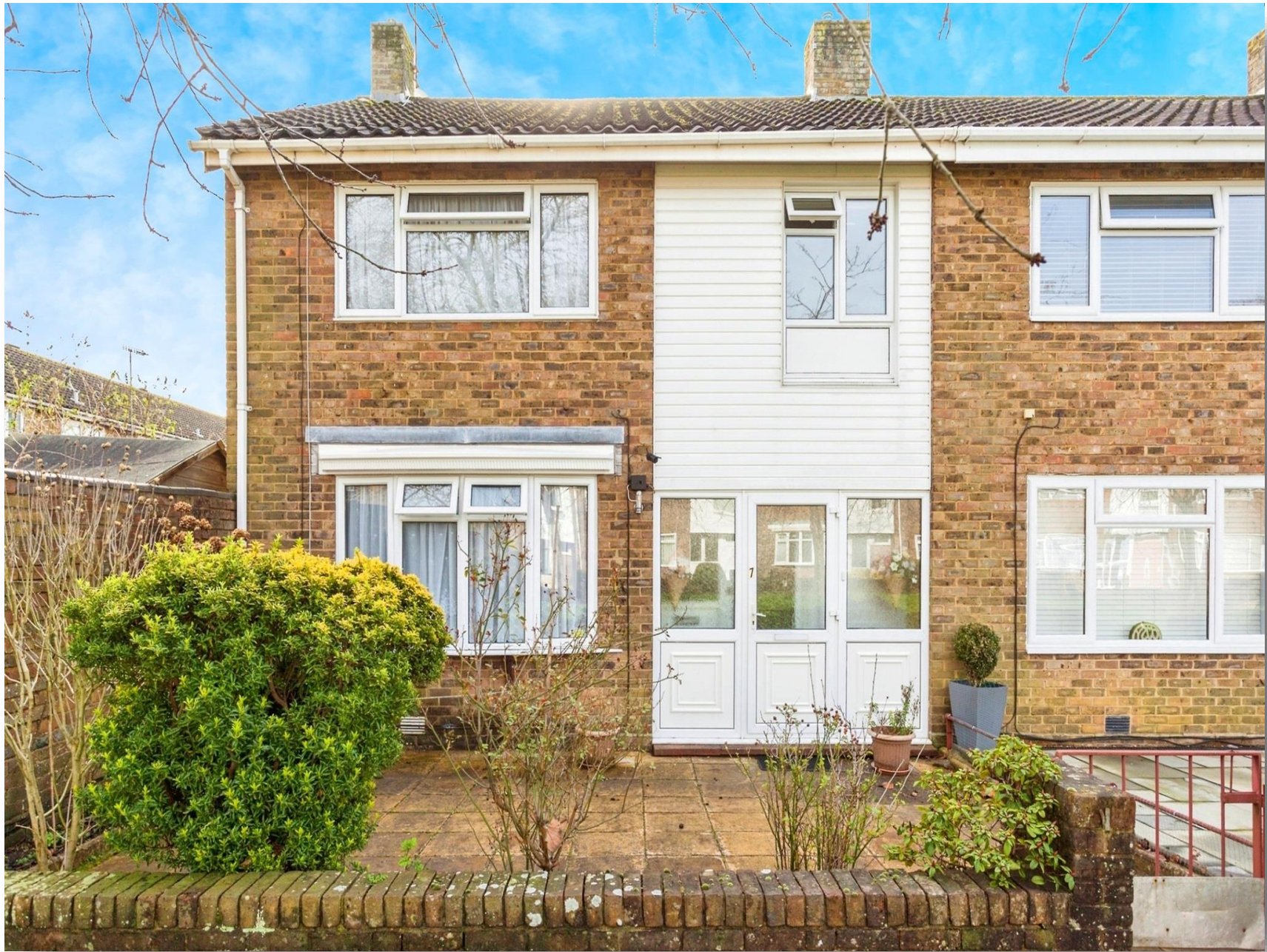
Doncaster Walk, Crawley RH10 6LY