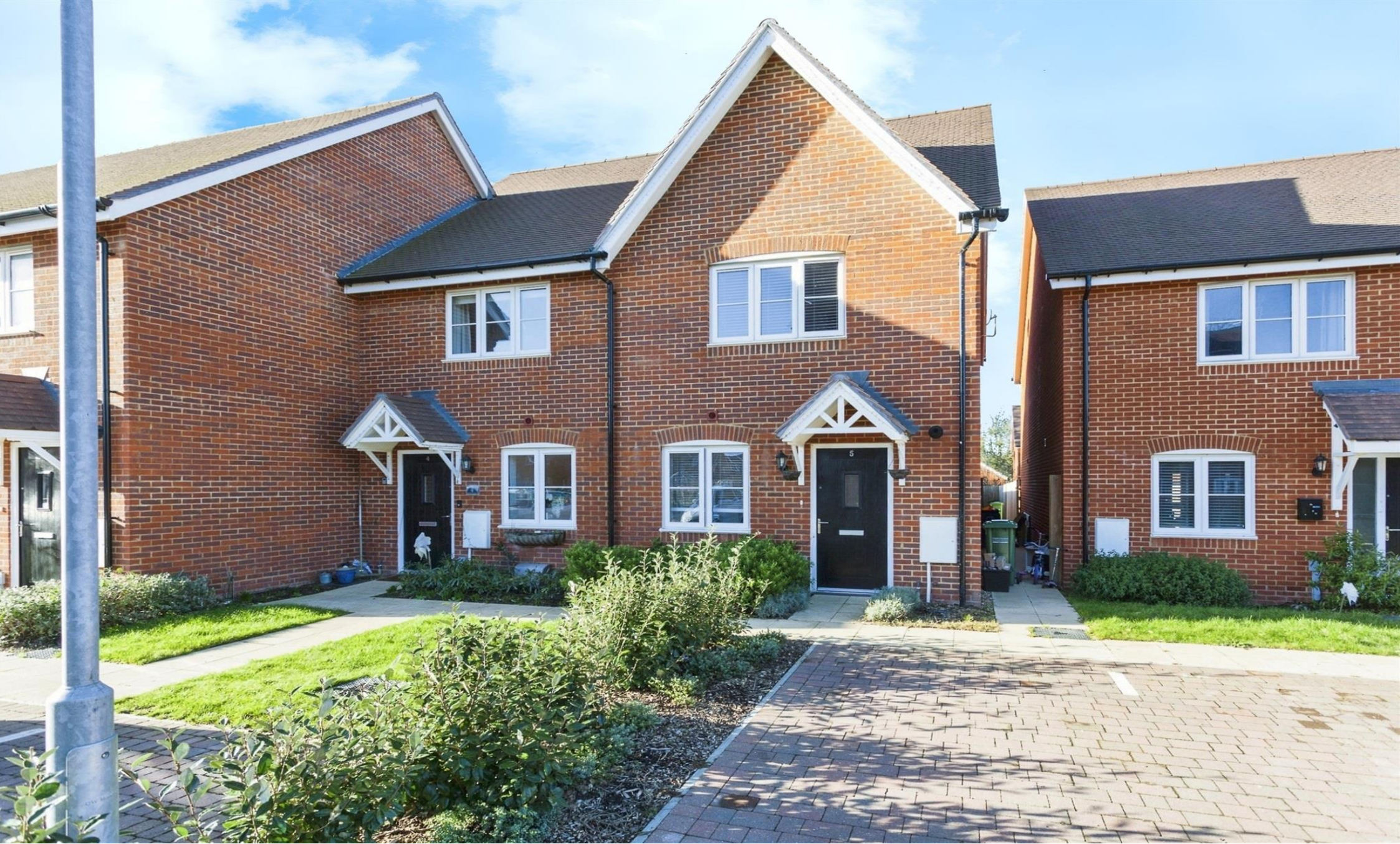
Amherst Row Hoadley Road, Horley RH6 8TH