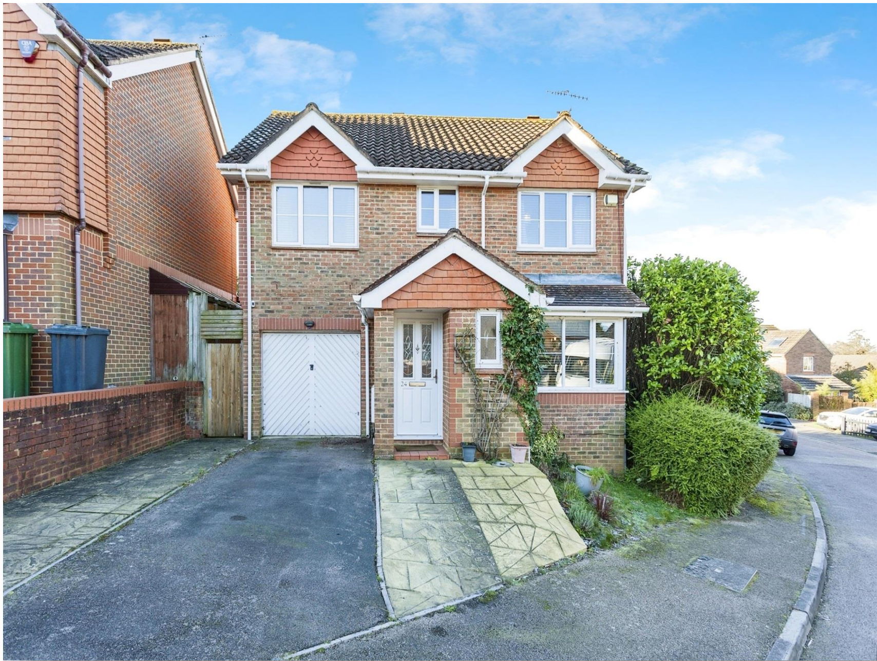
Casher Road, Maidenbower, Crawley, RH10 7JG