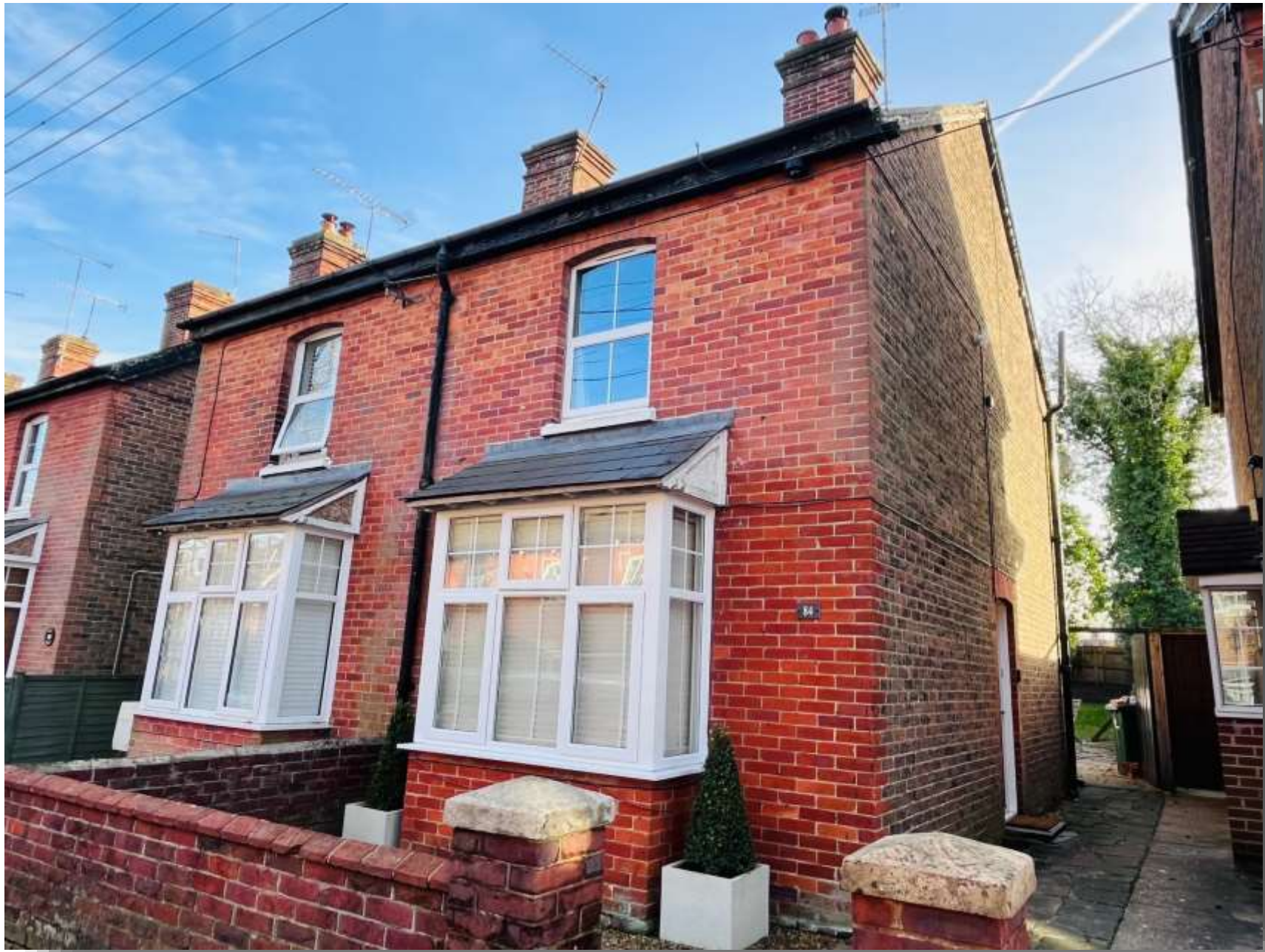
West Street, Crawley, RH11 8AW