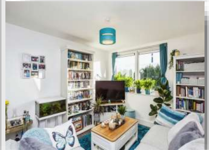
Octagon House Russell Way, Three Bridges Crawley RH10 1GW