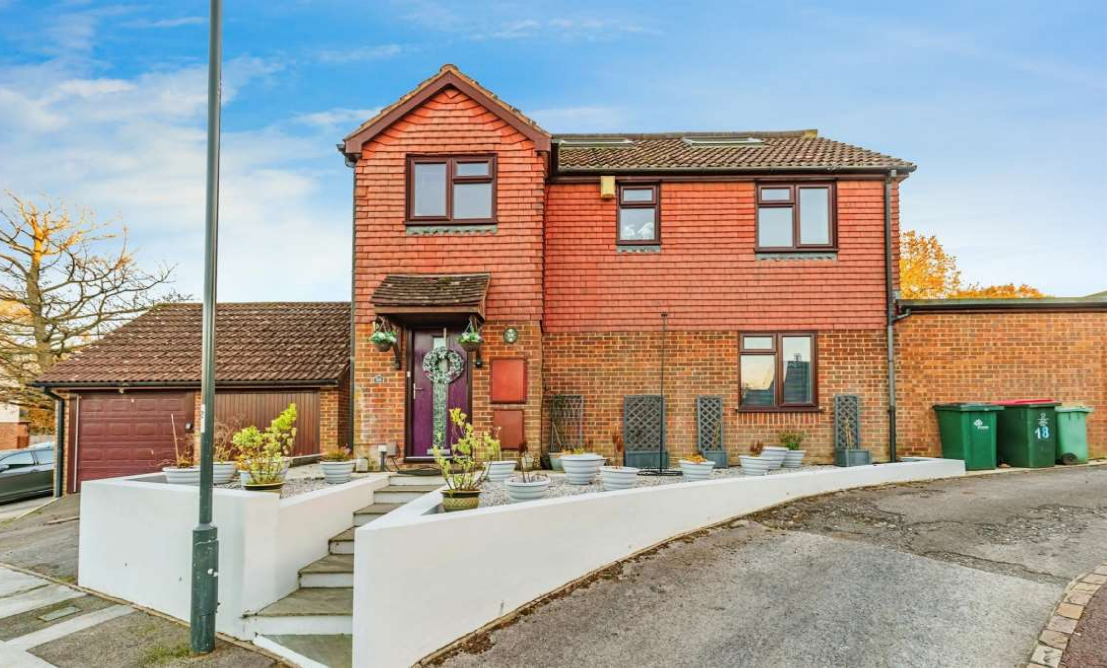
Wilberforce Close, Crawley, RH11 9TD