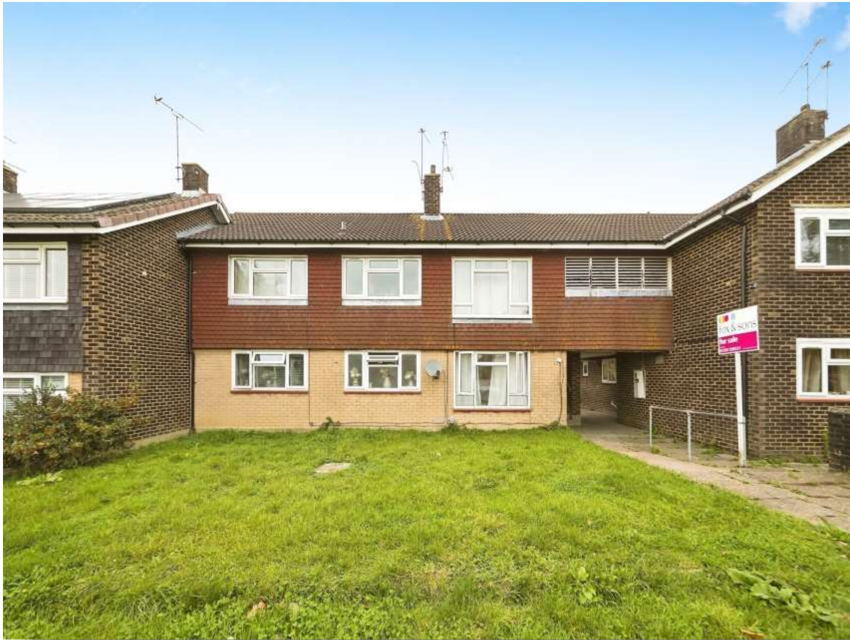
Medway Road, Crawley, RH11 8LA