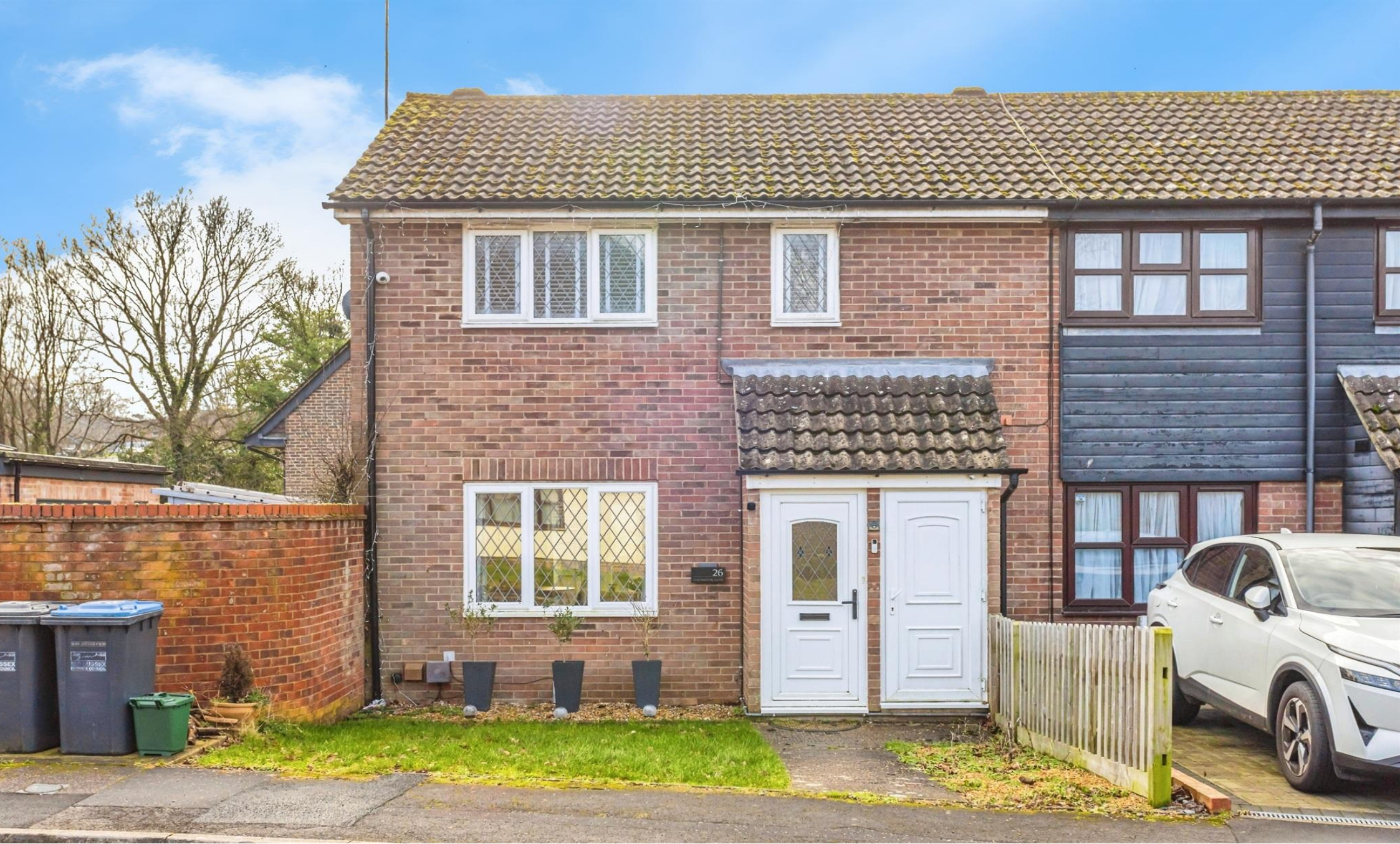
Chiltington Close, BURGESS HILL RH15 8SH