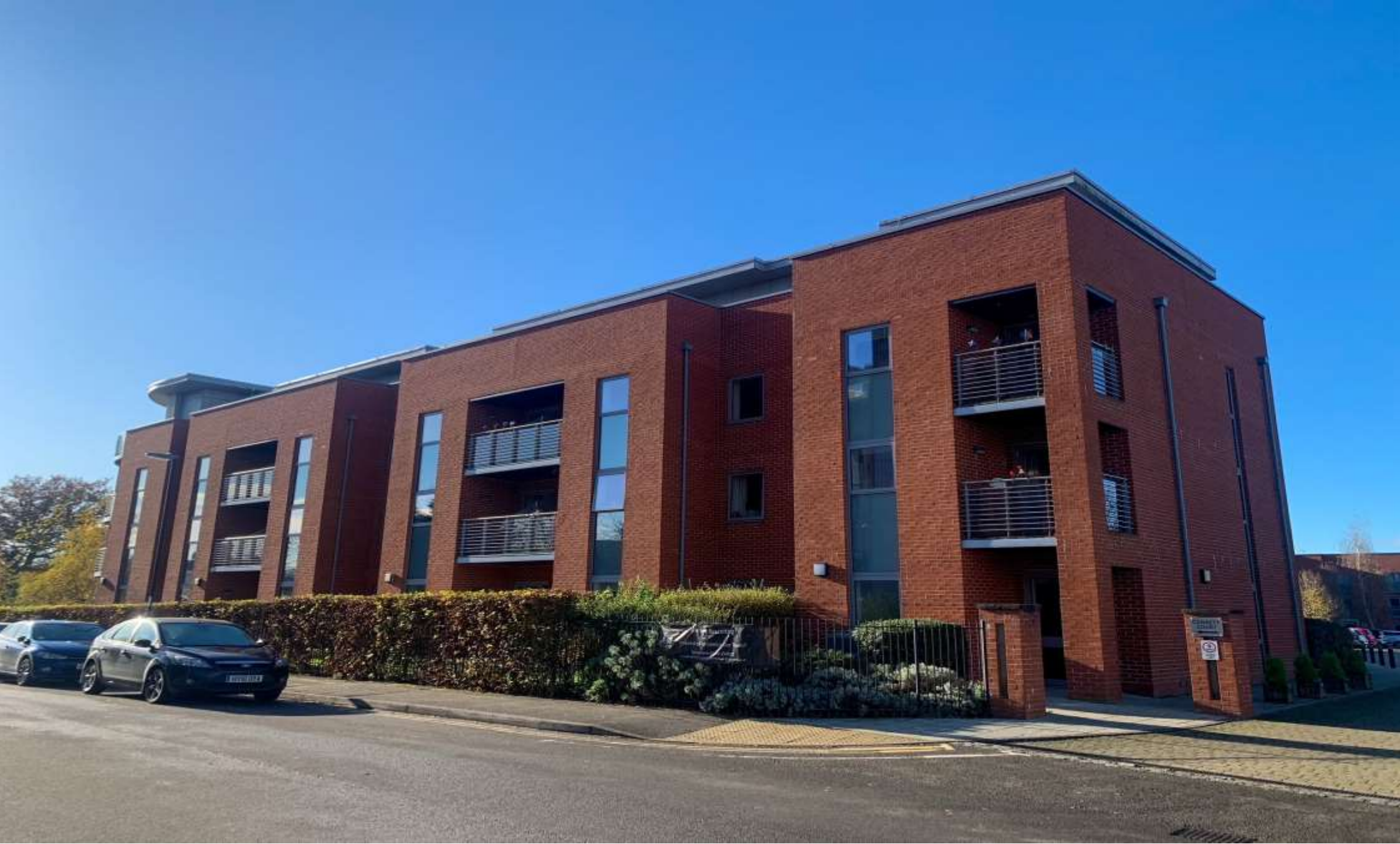
Corbett Court The Brow, Burgess Hill RH15 9DD