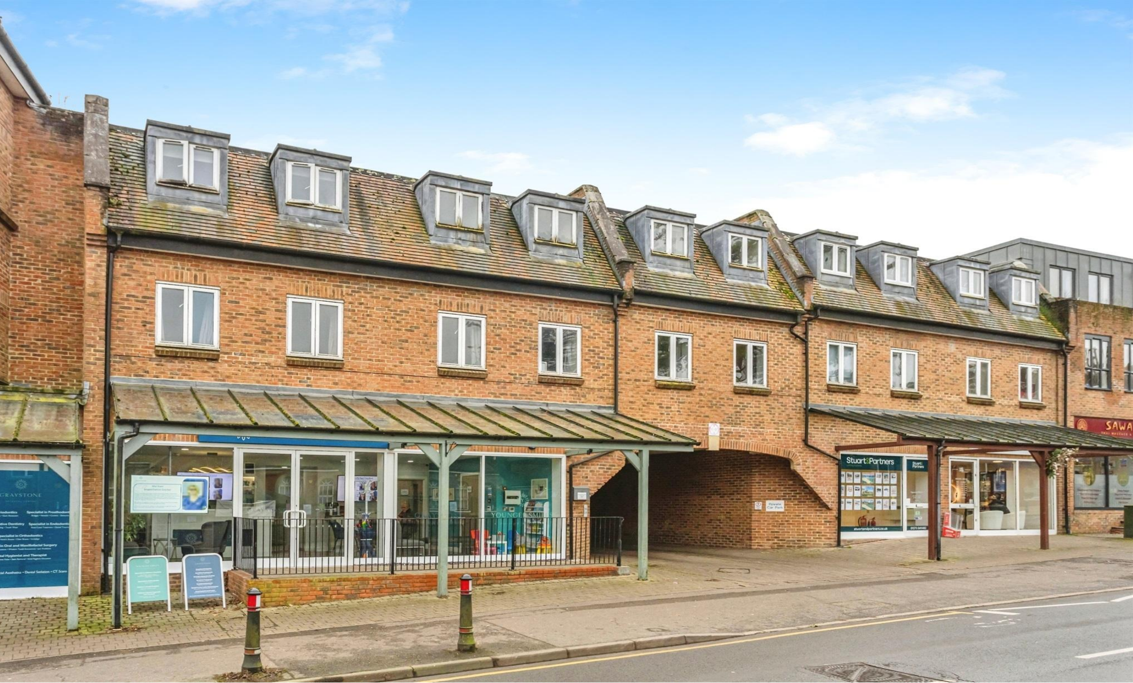
Adastra Place Keymer Road, Hassocks BN6 8AJ