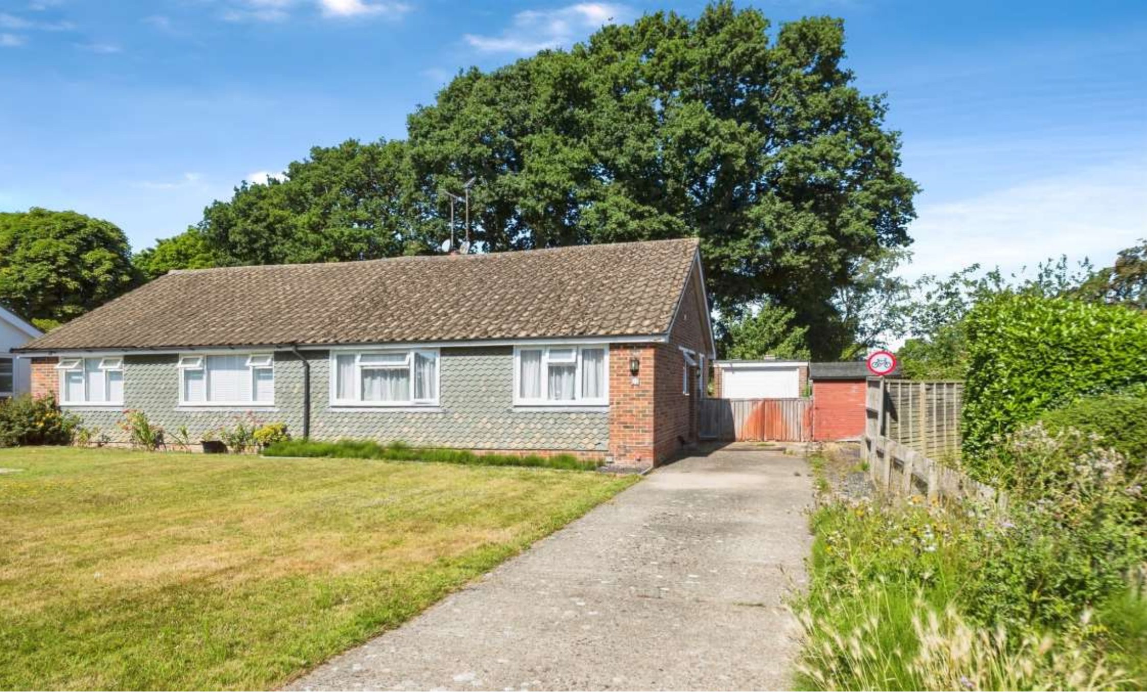
Fir Tree Way, Hassocks BN6 8BT