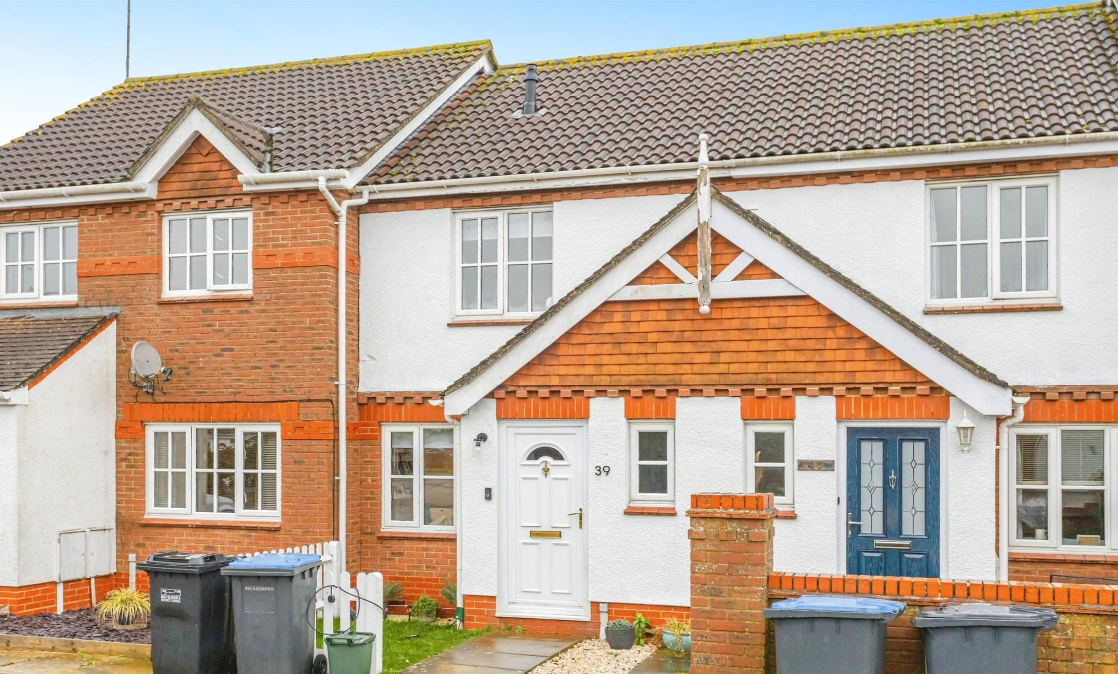
Clifton Road, Burgess Hill, RH15 8US