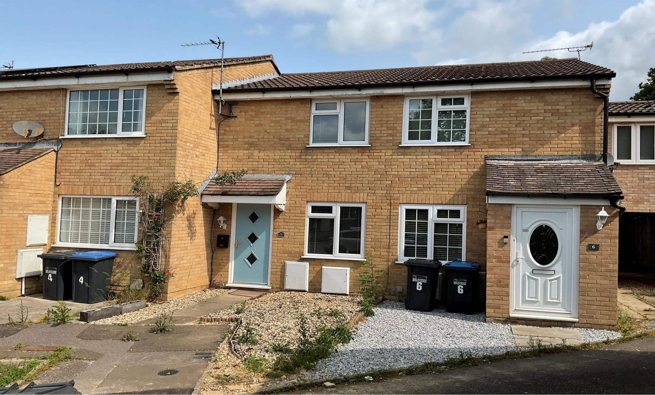
Gander Close, Burgess Hill RH15 8SE