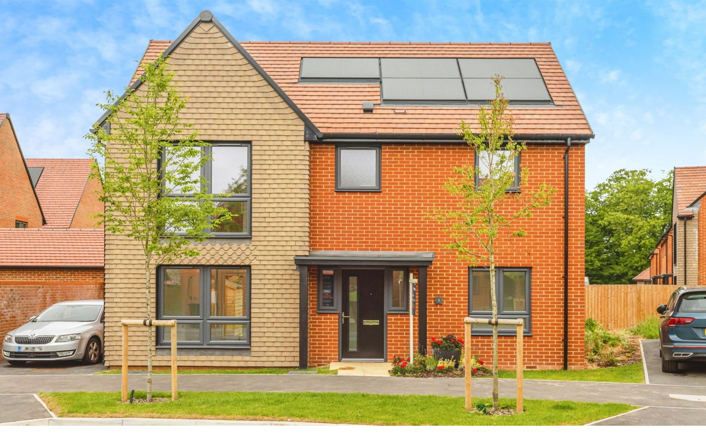
Fallow Wood View, Isaacs Lane, Burgess Hill, RH15 8RA