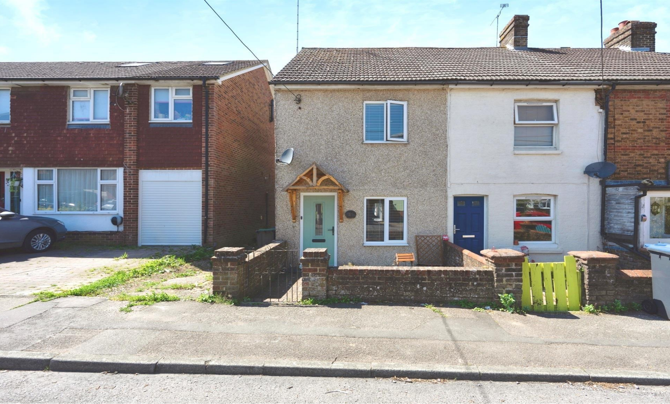
Fairfield Road, Burgess Hill, RH15 8NP