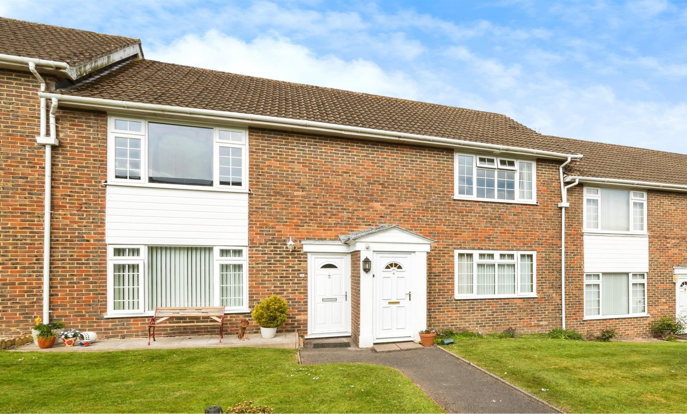
Clerks Acre, HASSOCKS BN6 8QY